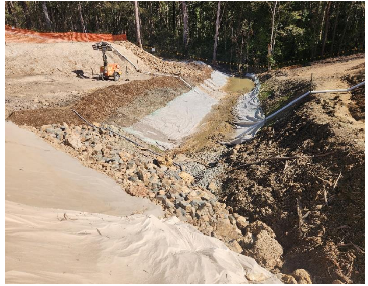
Image 6: Main line, east to west clean water creek diversion, view to the western side at outlet.