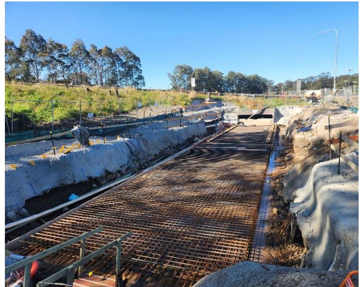
Image 2: Dark Creek culvert works including diversion, northern interchange, Jesmond Park, view to the east.