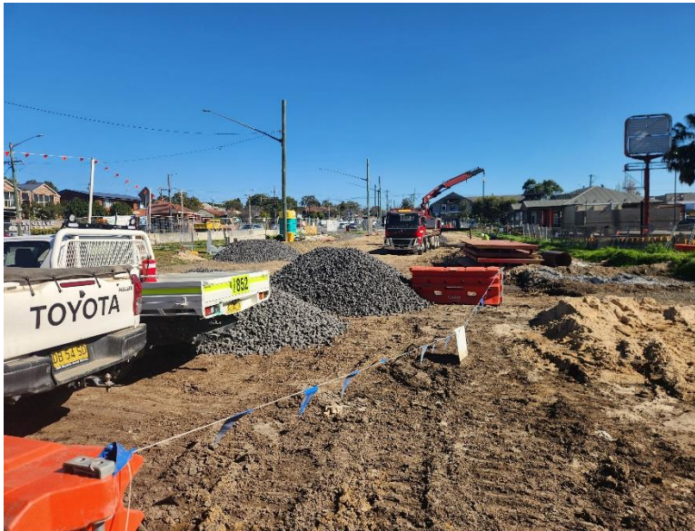
Image 1: Works around the old Hungry Jacks site, at the northern interchange, Jesmond Park. View to the west.