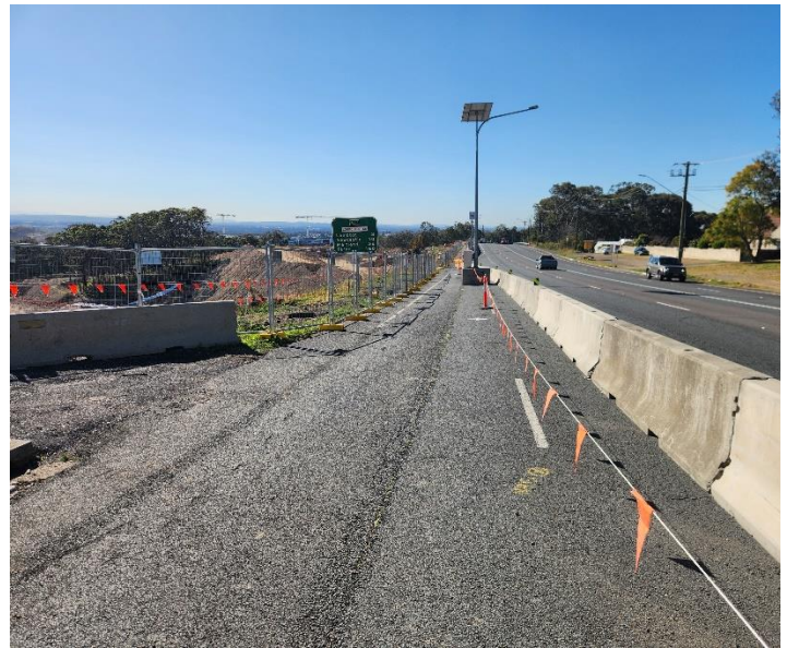
Image 8: Southern works at the cnr of McCaffery Drive and Lookout Road. All earthworks. View is looking north along Lookout Road.