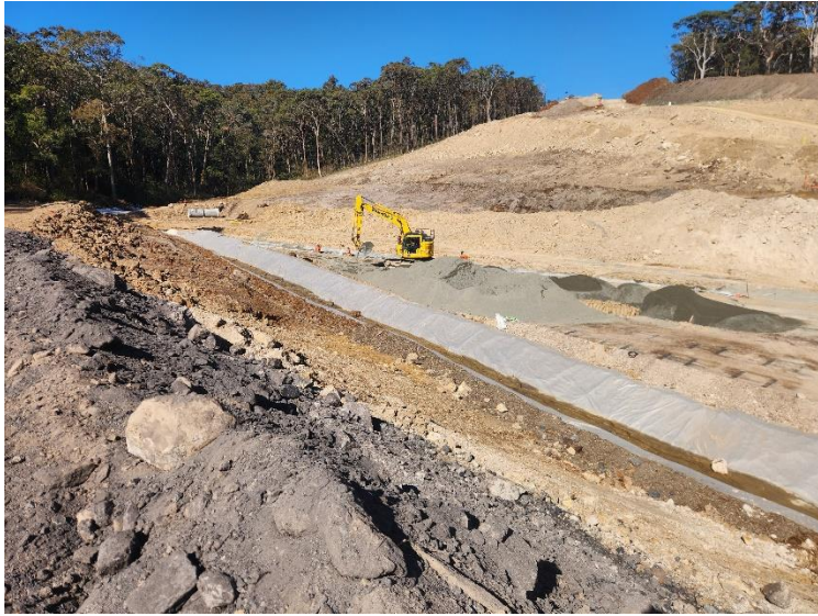
Image 5: Main line, east to west clean water creek diversion – general view of earthworks. View is to the southeast.