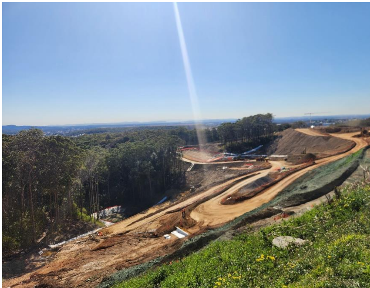
Image 7: Southern works at the cnr of McCaffery Drive and Lookout Road. All earthworks. View is to the north.