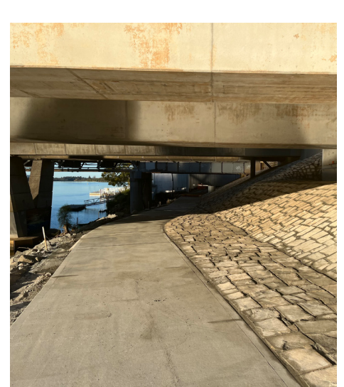
Stone pitching on the southern foreshore is complete and the underpass will open soon.