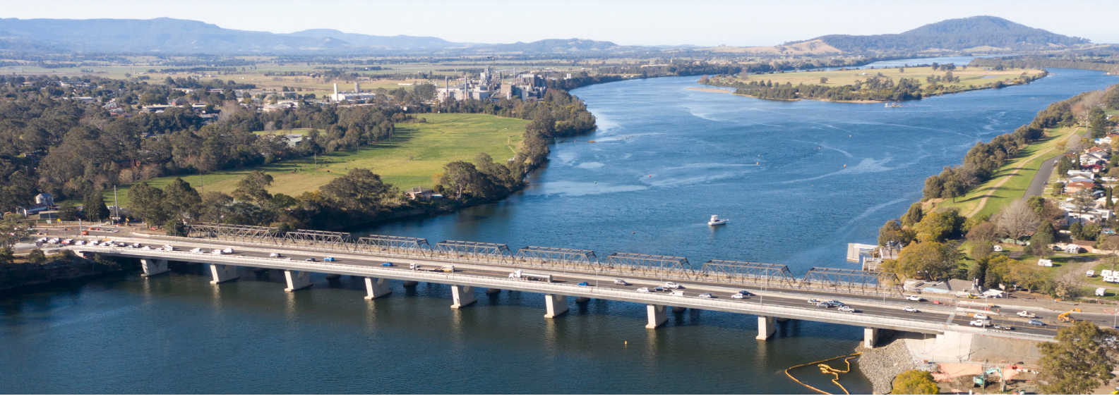
Looking east over the Shoalhaven River, towards Shoalhaven Heads.

The Nowra Bridge project will provide a new four lane bridge over the Shoalhaven River, upgraded intersections and additional lanes on the Princes Highway.