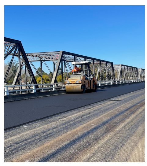
Applying the new asphalt surface on the middle bridge.