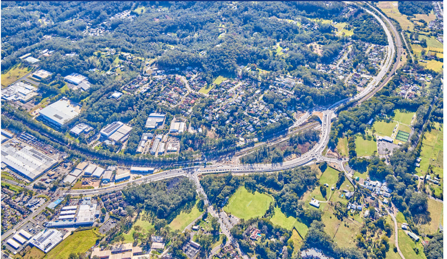
Aerial view of the project area

The NSW Government has delivered the duplication of the Pacific Highway between Ourimbah Street and Parsons Road at Lisarow.