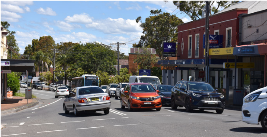
Traffic through Wyong Town Centre

The Pacific Highway is the main route through Wyong Town Centre and is a major urban arterial road connecting the northern suburbs of the Central Coast. It is currently a single lane in each direction through Wyong. Wyong and surrounding suburbs have experienced a large increase in the volume of traffic in recent years due to sustained urban growth across the Central Coast region. An environmental assessment and concept design was displayed for feedback in October 2015 and the project was approved in February 2016. Preliminary work including some early demolition of existing buildings and most of the land acquisition has taken place. The project team is now reviewing key elements of the design to ensure the project still meets the current needs of the community.