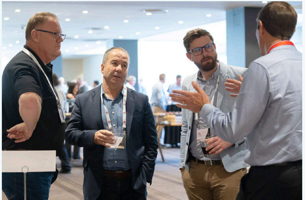
Our team presented the project to local industry at an event in the Hunter Valley in November this year

The project team is also engaging with the local construction industry around opportunities to partner on the delivery of this major project.