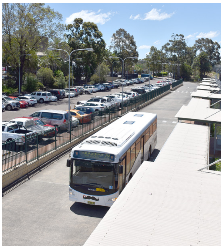
Existing parking and bus facilities on western side of Wyong Station

Scan the QR code to visit the project webpage.