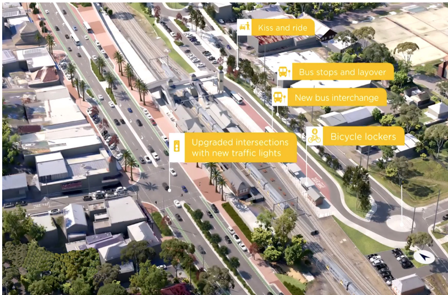
Artist's impression of proposed station upgrade