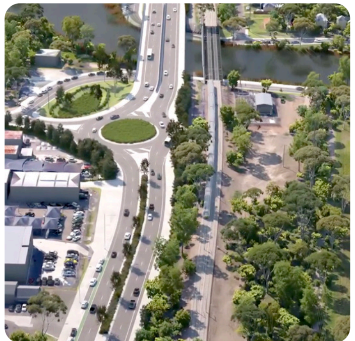
Artist's impression of proposed roundabout and new twin bridges over Wyong River

A road environment that maintains the town's identity while providing opportunities for future revitalisation and growth