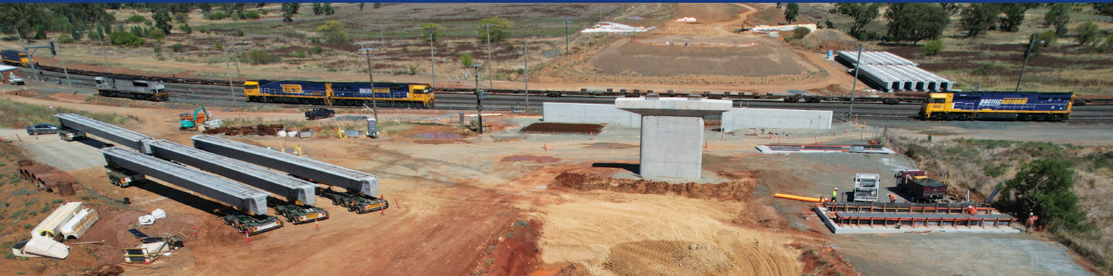
Girders have arrived for the construction of the Bridge over Rail and Hartigan Avenue

Work on the Newell Highway upgrade, Parkes Bypass, is well underway, and some key features of the project are taking shape. The project will improve connectivity, road transport efficiency and safety for local and interstate motorists. The Parkes Bypass project is jointly funded by the Australian and NSW Governments.