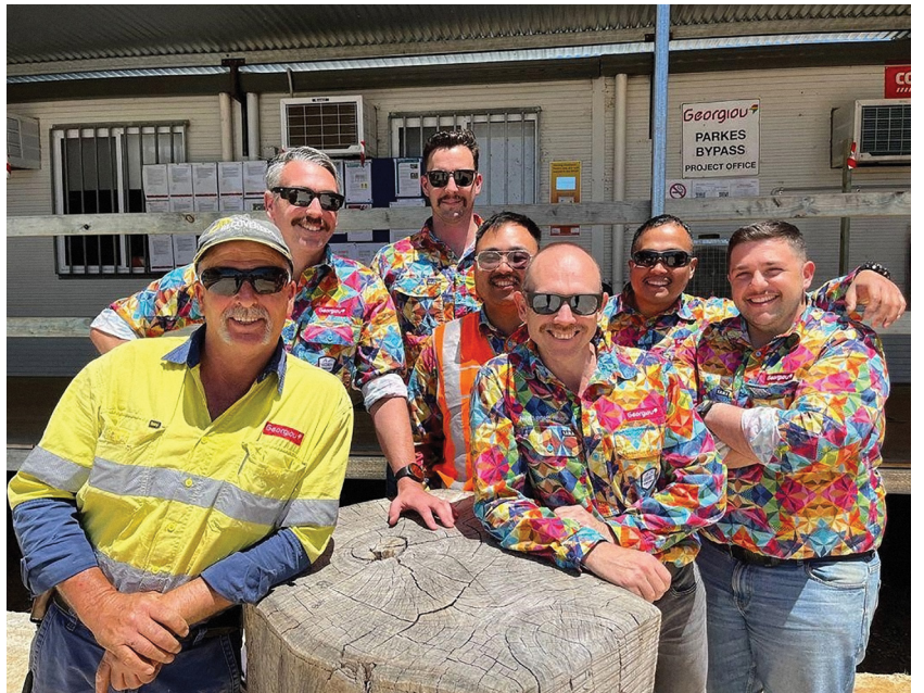
Parkes Bypass project team showcasing their Funky Friday shirts

The team on the Parkes Bypass wanted to show their support and raise funds for this vital cause.