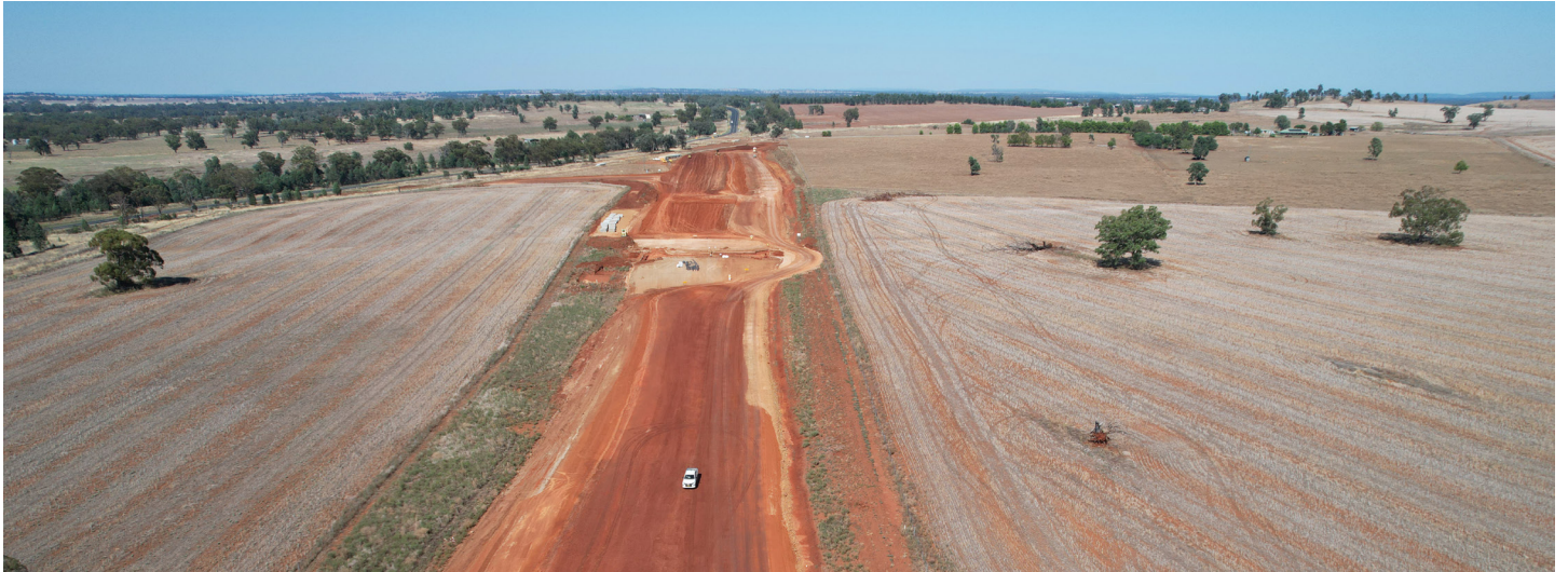
Southern Connection looking towards the Newell Highway