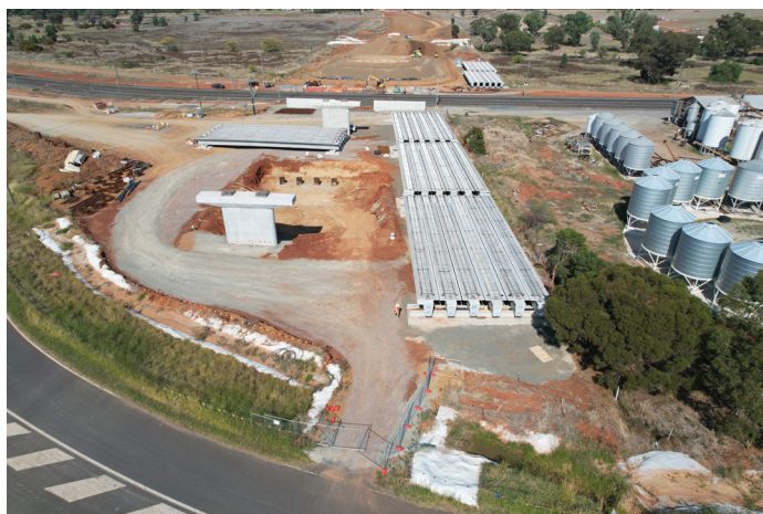
Rail bridge girders delivered to site

The Bridge over Rail and Hartigan Avenue is a 200-metre-long bridge consisting of 36 precast super T-girders. Each girder weighs 60 tonnes and will be lifted and installed to provide a six-span superstructure. The deck will then be constructed and lifted on to the girders to connect to the rest of the bypass.