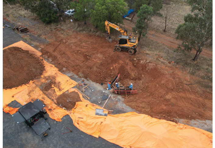
Asbestos removal and encapsulation on site

Read more about Naturally Occurring Asbestos in our latest update and Frequently Asked Questions on our Website