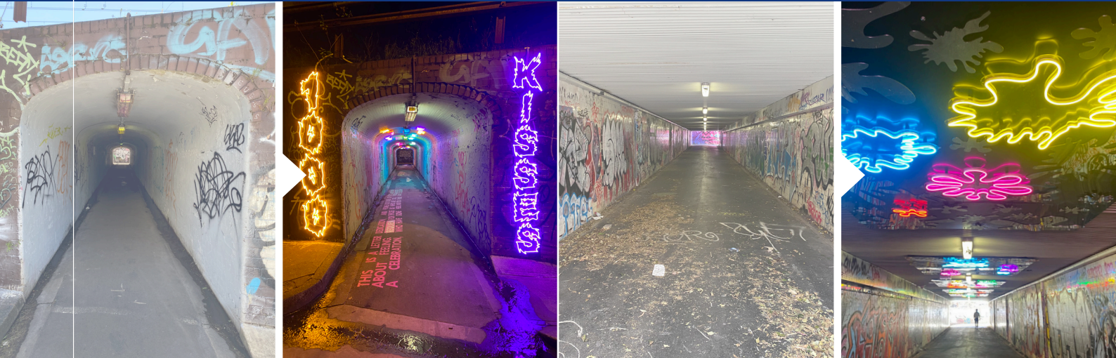
Before and after: Kieran Butler '1000 Kisses', Newtown