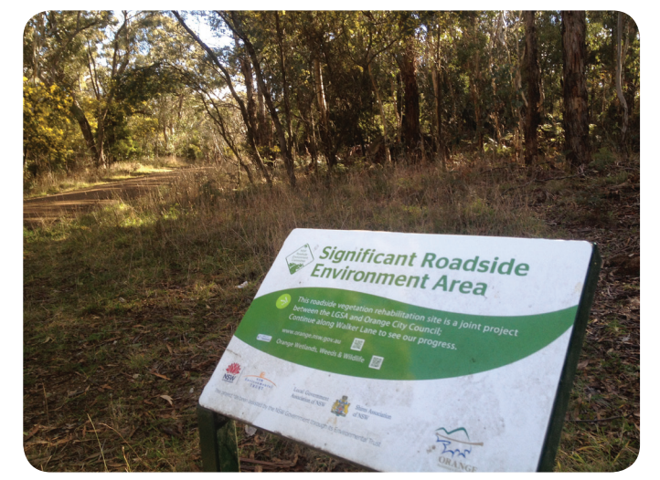
Example of a Significant Roadside Environment Area sign

Roads are regularly used by everyone in the community. Placing signs on roadsides will create interest in the roadside environment. Signs also alert roadside users and works crews to areas which need special care particularly those high priority sites within high conservation value roadsides.