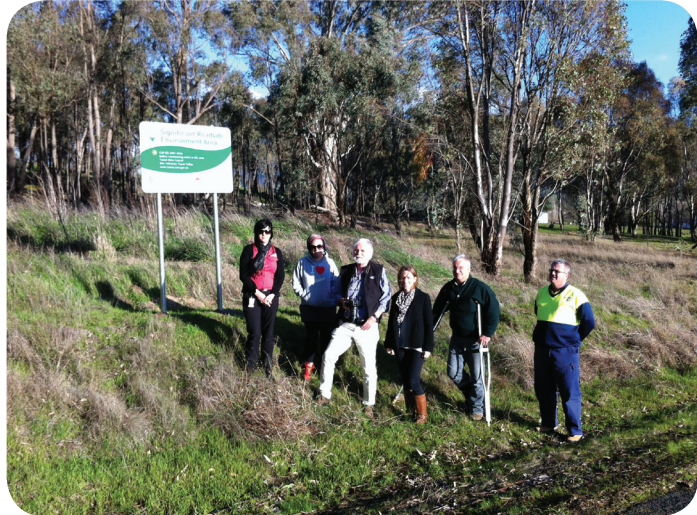
Members of the NSW Roadside Environment Committee inspecting roadside environmental management initiatives in the Tumut area

Details of recommended management actions for these areas and sites can be found in 'Managing Roadsides 3: Implementation'. Thus monitoring and evaluation should be related to: