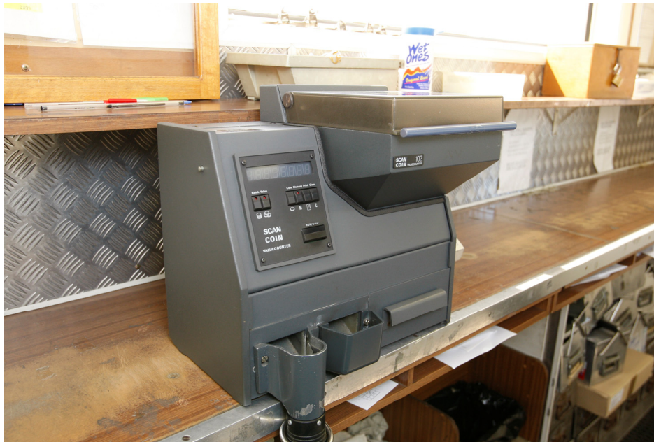
Coin counting machine

1987 would reduce two-way annual traffic by 2.5 per cent in the first year of the higher toll'. This reduction in traffic was expected to remain if the toll was indexed each year. 62 The increased charges did result in a decline in southbound travellers across the bridge however, this was short lived. 63 Aside from periodically helping to relieve traffic congestion another by-product of the higher toll charge was that it increased the funds available in the Sydney Harbour Bridge Account.