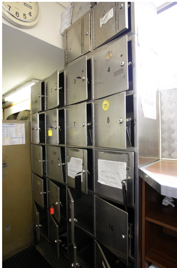
Toll Collectors' secure lockers