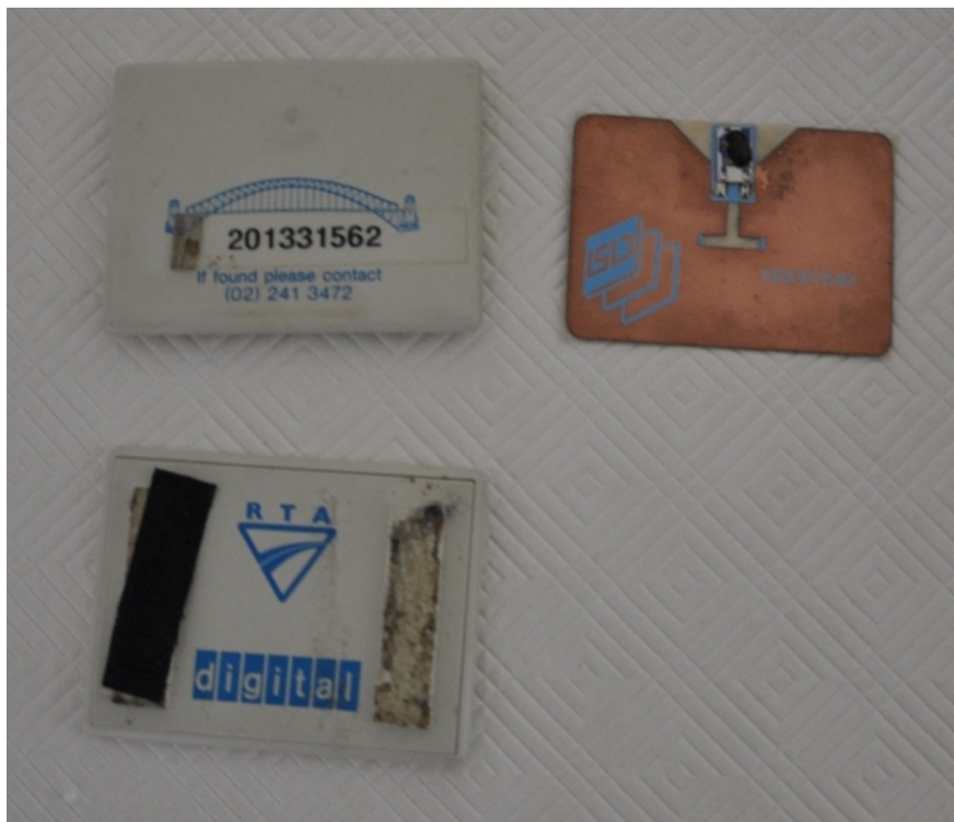
Original Sydney Harbour Bridge ETag, showing internal copper antenna and small integrated circuit above it, and Velcro mounting strips on outer casing

Impressively the response rate of the tag was less than 40msec, and it cost less than $20 per tag to construct. 74