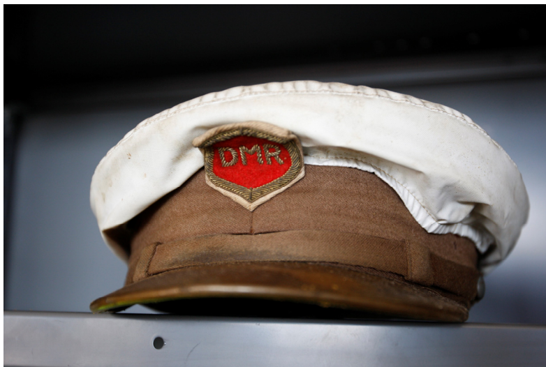
Early Toll Collector's hat

That was changed to an orange vest that was done up at the front and eventually became a fluoro yellow pullover vest. The safety stripes were an OH&S hazard...because they could catch on door handles or whatever and the vest that opened at the front was deemed a hazard too if left open. (Janet Miller SHBTOH CD5, 6:29)