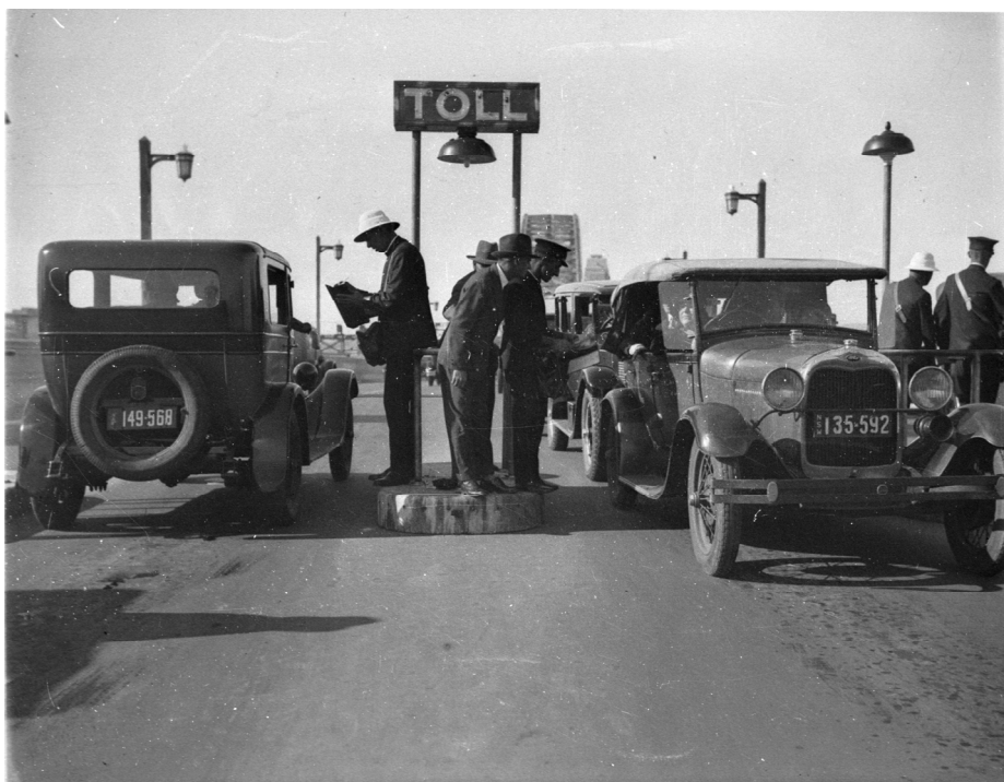
First cars to pay the toll on the Sydney Harbour Bridge

The large number of vehicles and passengers crossing the bridge during the first day indicates Sydneysiders were keen to be amongst those who took part in this historic occasion. In fact one man, George Skinner, queued at the railway ticket office for two days waiting to purchase the first ticket on the first train to cross the bridge. Ticket number 00001 was a treasured souvenir of that trip across the bridge in 1932. 10