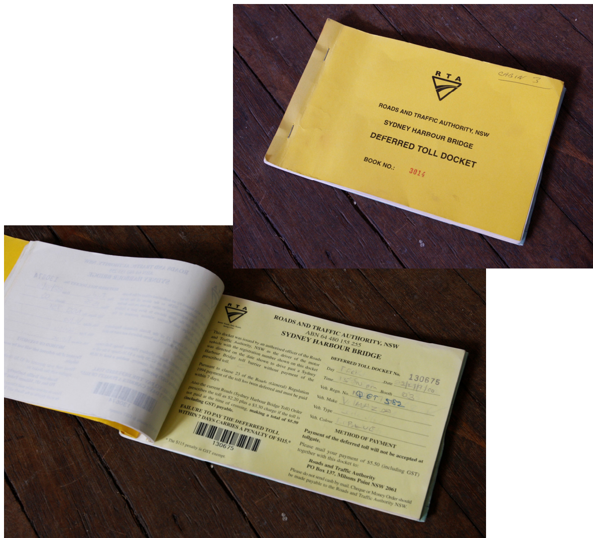
Sydney Harbour Bridge Deferred Toll Docket book