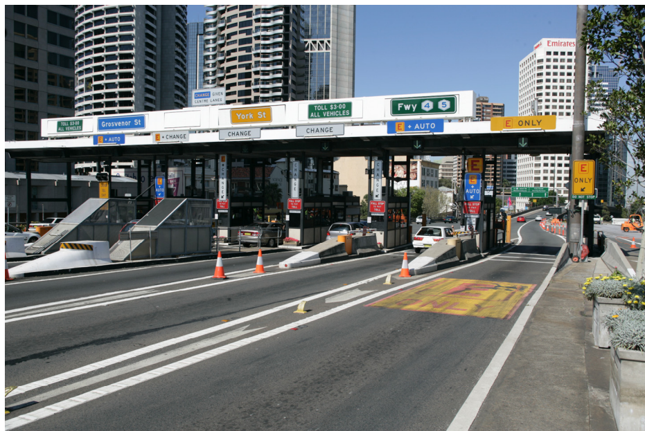
Multiple toll payment options on the Sydney Harbour Bridge

While it was a very good system, a few problems were found. One of these was identified with the move from Stop/Go traffic barrier to high speed lanes with the dedication of Lane 1 at Milsons Point to particular vehicles.