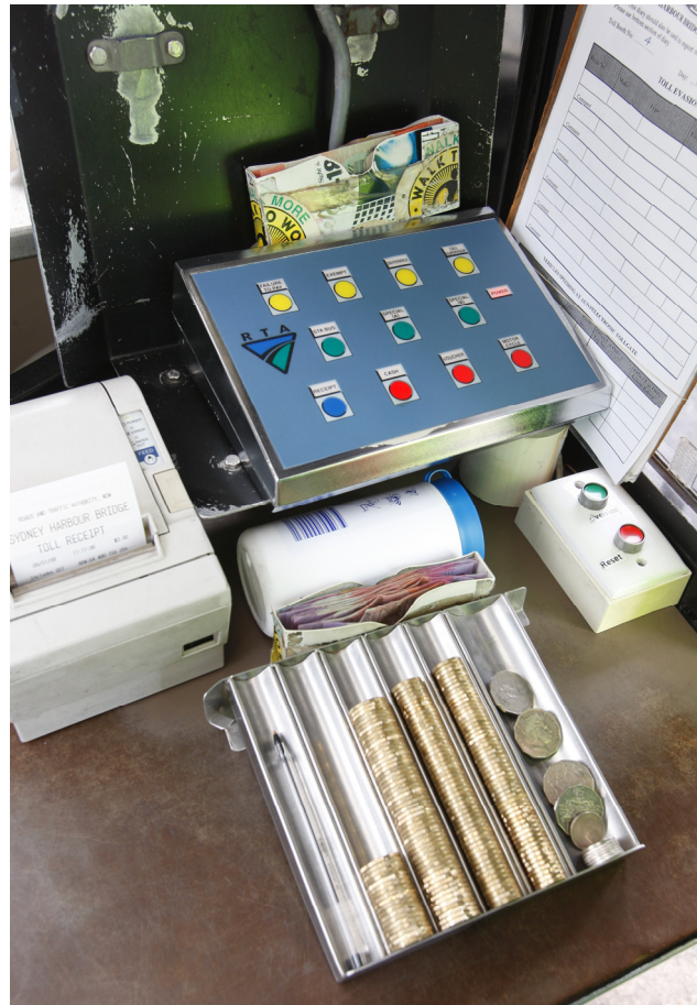
Inside the toll booth