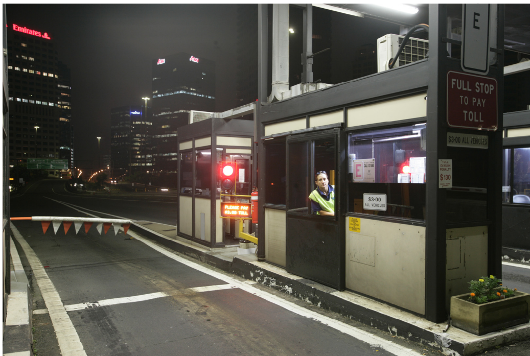
Toll Collector during night shift on the Sydney Harbour Bridge