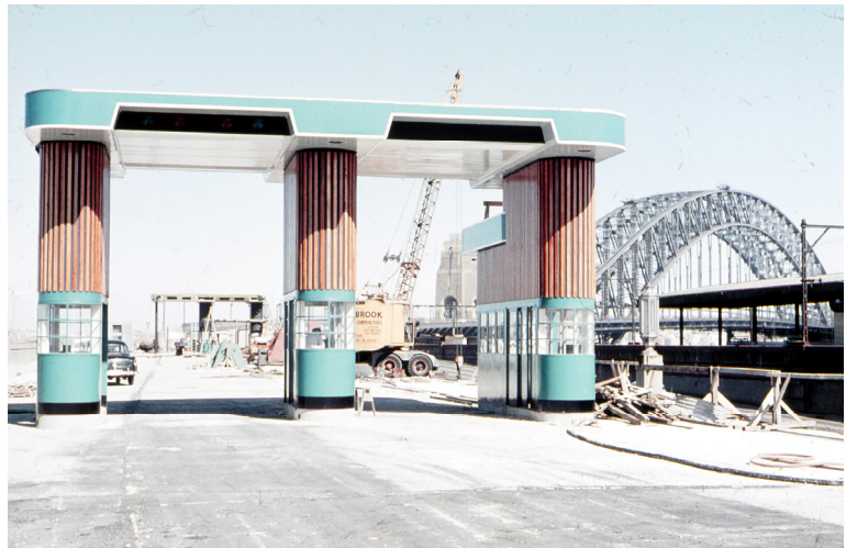
1958/1959 toll cabin on northern approach