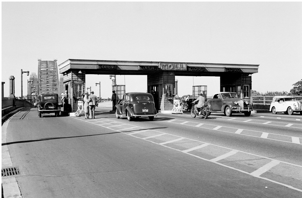
Sydney Harbour Bridge toll booths, 1949

In June 1934, strong circular shields were installed at either end of the islands to protect the collectors from traffic accidents. Also in this year experiments and discussions were undertaken to attend to the problem of collectors receiving electric shocks from static electricity generated by passing vehicles passing through the toll bar. In addition to the toll bar improvements, improved barricades were erected along the pedestrian walkways 'owing to the increasing number of fatalities occurring from footways of the bridge.' 14