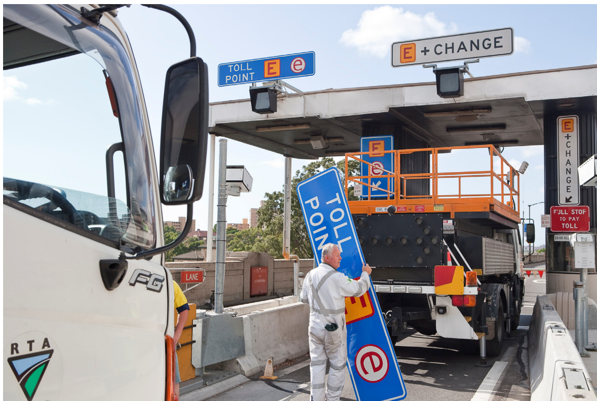
Changeover to cashless tolling on the Sydney Harbour Bridge

As well as the human resources aspect of going cashless, the RTA had a significant amount of work to do to prepare and install the infrastructure required for a fully electronic tolling system. This included installing gantries and Q-Free multi readers, video surveillance systems and traffic management systems.