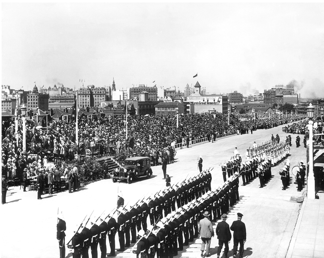
Sydney Harbour Bridge opening ceremony, 19 th March 1932

Thankfully for those in the northern parts of Sydney an amendment was made to the 1922 Bridge Act in 1932. The Sydney Harbour Bridge (Administration) Act stipulated that the municipalities adjacent to the bridge need only support the financing of the bridge until 31 December 1939. The Amendment also made it clear that the Sydney Harbour Bridge would be paid off by contributions from the Railway and Tramway Authorities according to a set rate for each ticket sold to travel across the bridge by either rail or tram, 7 a toll which corresponded to that charged on the vehicular ferries used before the bridge was built and finally, any revenue that was accrued by properties let after having been purchased previously 'for bridge purposes'. As well as paying for the Sydney Harbour Bridge, it was expected that these sources of revenue would ensure enough money to maintain and light it well, and cover the costs associated with collecting tolls and administration. 8