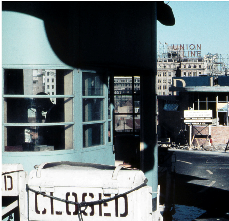
1958/1959 toll cabin on southern approach to the Cahill Expressway (note the bus ticket toll receipts visible through the window)

Privately owned vehicles at this time made up the vast majority of traffic that travelled across the bridge and outnumbered the public transport used (both rail and road) to get into and out of the city from the north. 38