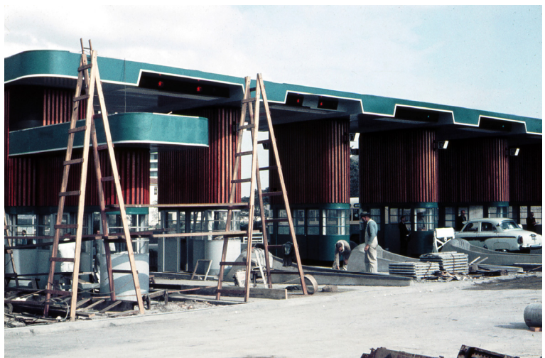
Construction work proceeding on 1958/1959 toll cabins