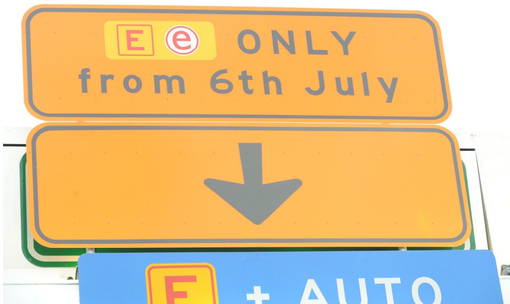
Progressive conversion of toll lanes on the Sydney Harbour Bridge

Electronic tolling was seen as the only efficient way to deal with traffic demand. The benefits of ETag tolling quickly became obvious with about 2,000 vehicles per hour being able to pass through the ETag lanes as compared to about 500-600 vehicles per hour through the single coin transaction cash lanes. As the number of people embracing the new ETag system increased, the number of cash lanes on the bridge were decreased. This changeover was a gradual process taking place over much of the decade of the 2000s. In July 2007, the Sydney Harbour Tunnel converted to electronic tolling only. 85