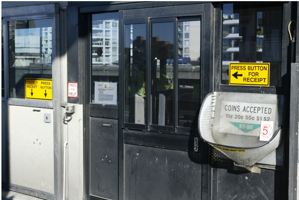
Automatic toll booth