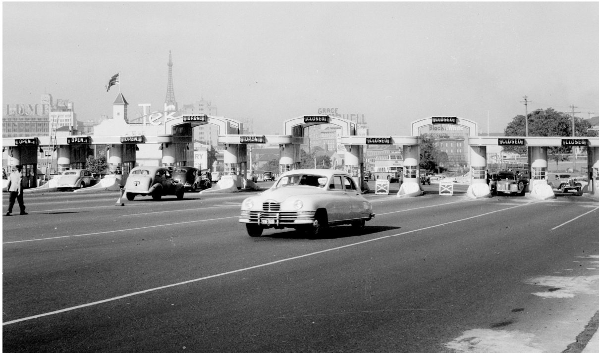
Sydney Harbour Bridge toll booths, 1950