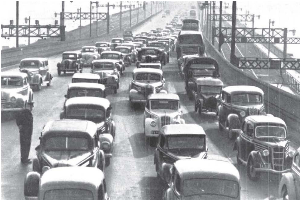
Morning Peak Hour on Sydney Harbour Bridge. Cards were issued to this traffic as quickly as it could pass through the Toll Barrier.