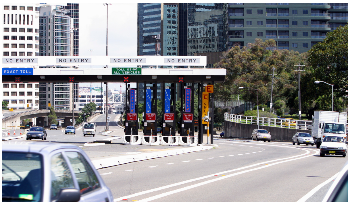
Movable toll booths

To enable the toll to be collected in this flexible lane allocation system, an ingenious solution was developed by the DMR, namely a set of movable toll booths which could be set in place on the extra south bound lanes during the morning peak period and then retracted for the peak northbound (untolled) traffic in the afternoon. 53