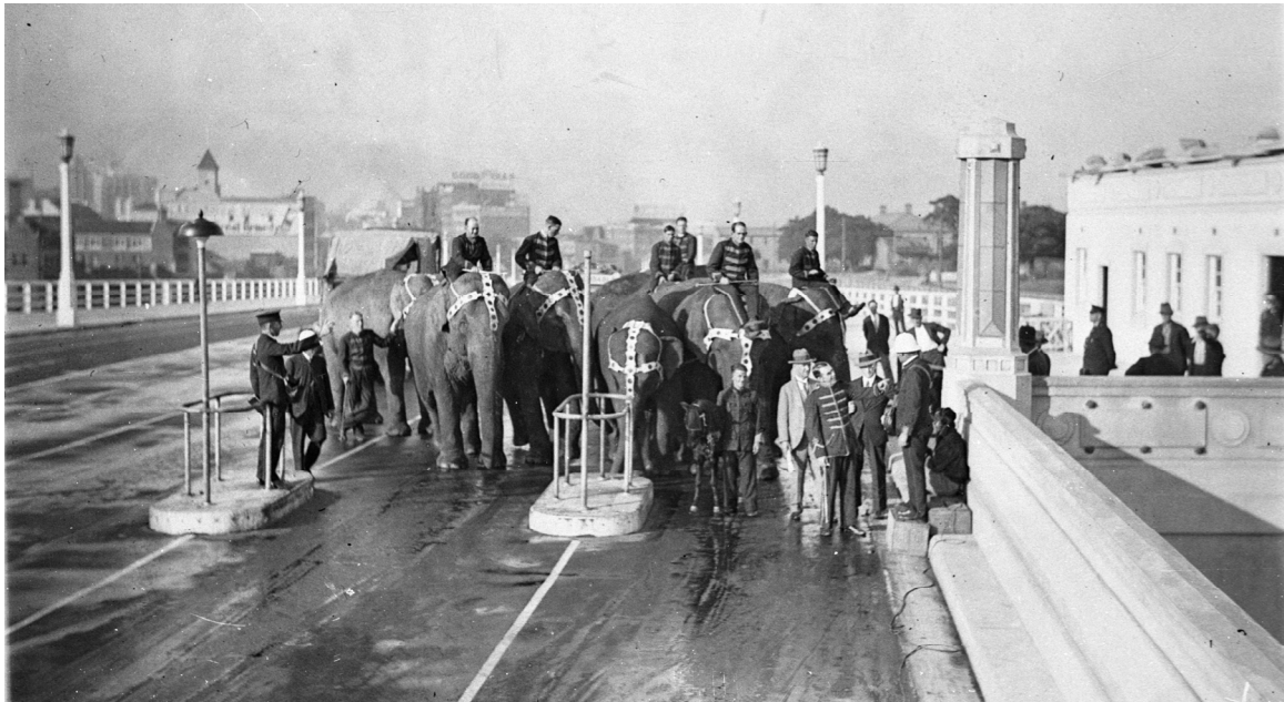
Elephants and their mahouts at bridge toll bar, April 1932

The toll was collected by a staff of toll collectors who can be seen in early photographs sporting a smart uniform including a flat-topped peaked cap, jacket and trousers and a leather satchel for cash collected and ticket issue appropriate to each category of crossing – vehicle and passenger.