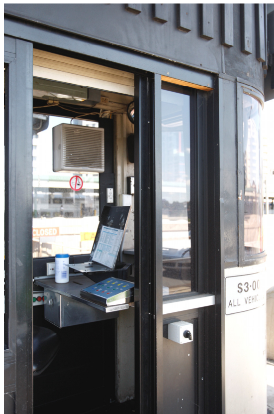
Milsons Point toll booth

Another task of the OH&S committee was to find a solution to this problem and modify the cabins to limit the amount of exposure to rain. Conditions in the cabins were greatly improved with the replacement of the little electric bar heaters to more substantial heaters and air conditioning. One debatable improvement was the introduction of piped music or muzak into the cabin, which most interviewees found to be not particularly pleasant. Later, a radio station was broadcast, but there was some disagreement as to the preferred station.