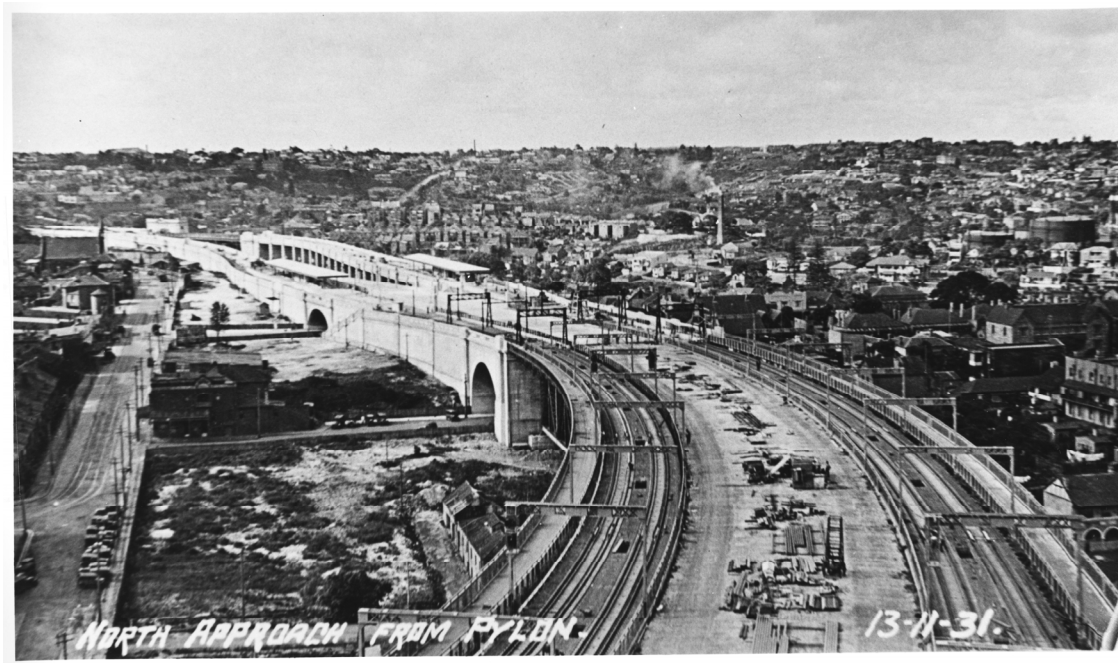
Early photo showing the tram tracks on the eastern side of the bridge

the DMR and stored for future use on the order of the Commissioner for Main Roads of the day. 36