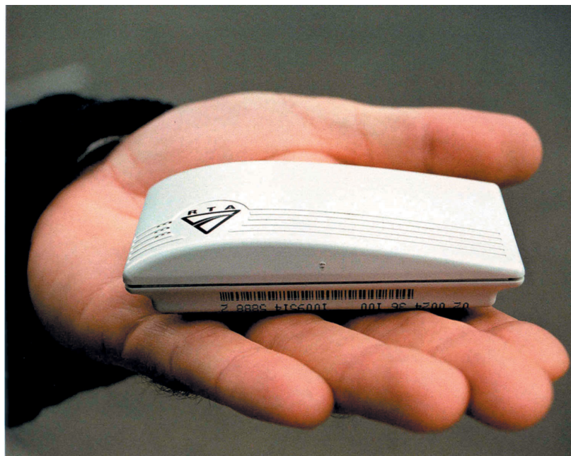
Fully interoperable RTA ETag

There were two toll increases during the early 2000s: $2.20 in July 2000 and then to $3.00 in January 2002.