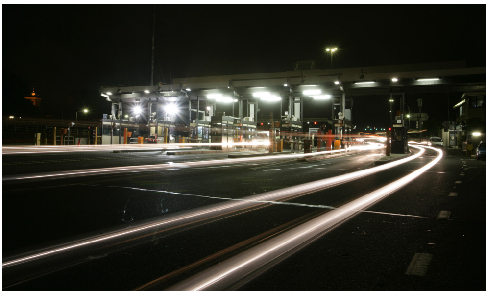
Night shift on the Sydney Harbour Bridge

Night shift was far and away the quietest shift which posed the challenge for some for staying awake and attentive.