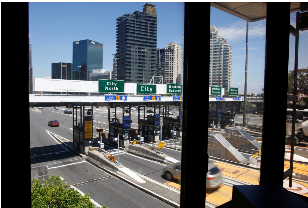
View from Toll Controller's office at the southern toll plaza