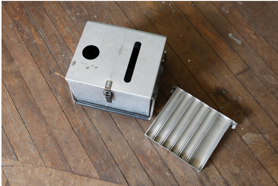
Toll Collector's cashbox and coin tray