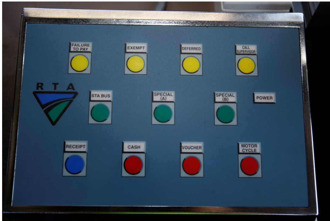
Toll collection panel