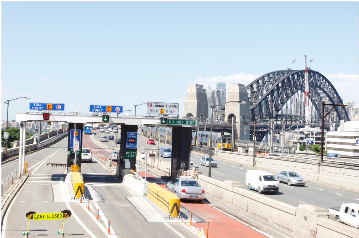
Cashless tolling on the Sydney Harbour Bridge