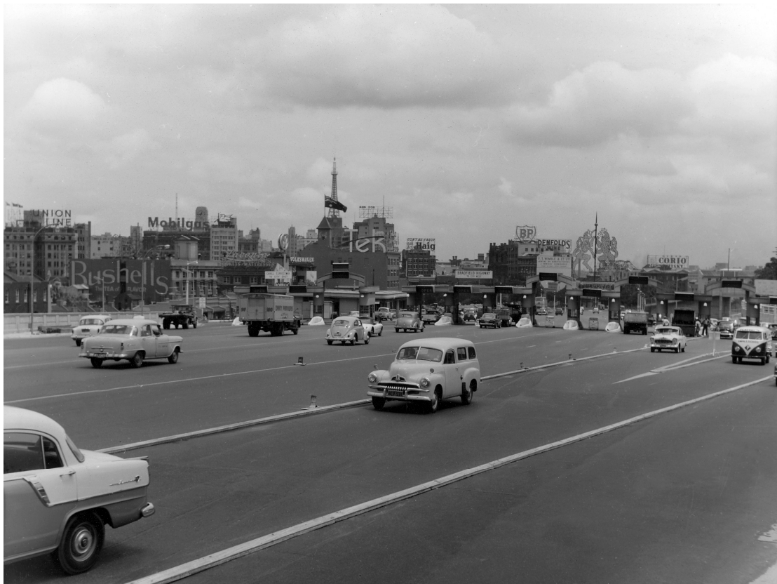
1958 traffic flow on the Sydney Harbour Bridge

Traffic in Sydney was at an all-time high by the mid 1950s. The DMR had to remain vigilant and continue to provide practical solutions to the problems associated with the ever-increasing volume of cars, buses and trucks using Sydney's roads, and in particular, the Sydney Harbour Bridge. Increased pressure was being placed upon the DMR to be at the ready with new designs and features that it could apply to the Sydney Harbour Bridge tolls to ensure that the traffic flowed across the bridge smoothly and that Sydney's traffic at large was well managed. Traffic levels were continuing to rise as more and more Sydneysiders chose to use their cars to get into and around town.