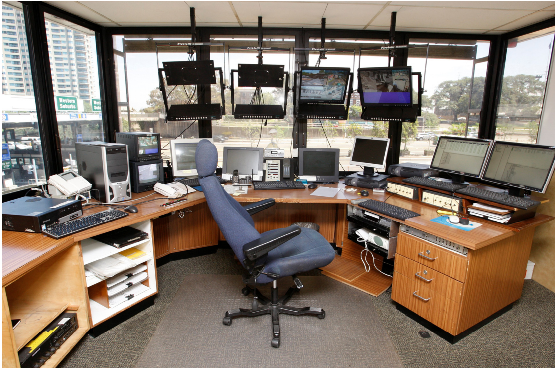
Inside the Toll Controller's office at the southern toll plaza

was used to record not only traffic movements but by the 1990s, the manual work of Toll Collectors who were subject to random sampling of their toll registrations as yet another check on the accuracy and security of the toll collection operations. 91