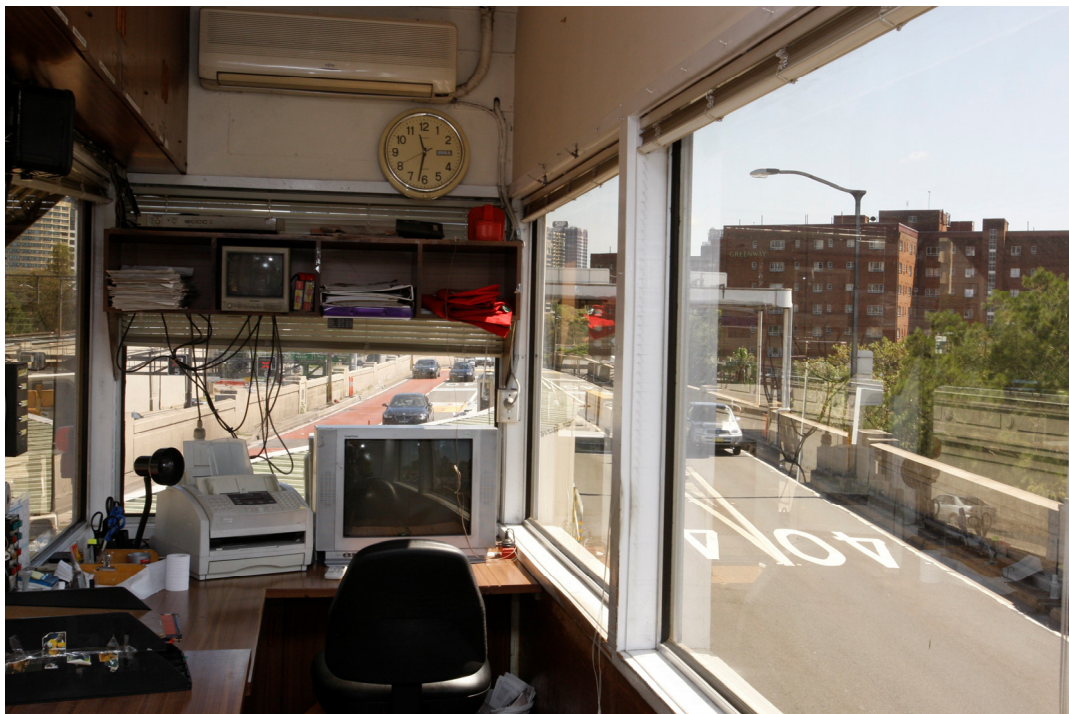
View from Toll Controller's office at the northern toll plaza

At the southern toll plaza the Toll Controller's office was located on the top floor of the Sydney Harbour Bridge Toll Office on the eastern side of the plaza. A large set of windows overlooked both the fixed and mobile toll cabins and afforded views north up the bridge deck and south into the city. At Milsons Point toll plaza the Toll Controller's office was in a narrow building between the first and second set of cabins. Once again this office had good views of traffic and the plaza. 90