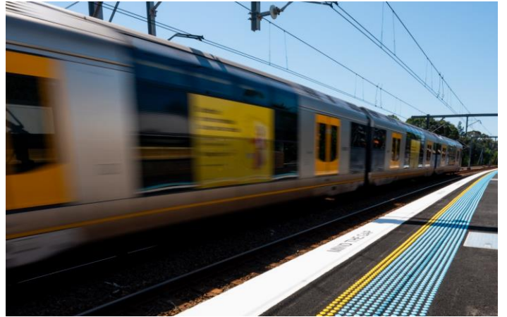
New tactile pads on all Platforms