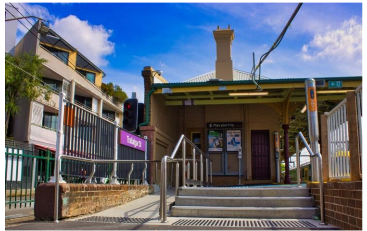
New ramp from Trafalgar Street to Platform 3