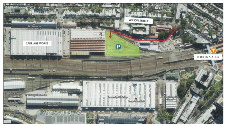
KEY - ACCESS TO PARKING