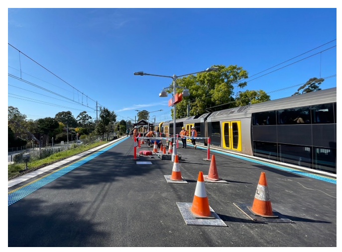
Above: New asphalt surface on platform with yellow and blue tactile ground surface indicators.