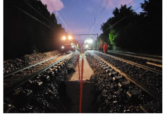
Rain or shine, cable installation work on the Arncliffe to Tempe Signalling Upgrade project in June and July 2024.