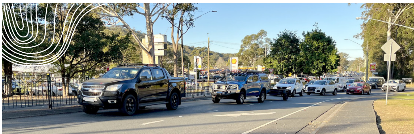
Avoca Drive upgrade at Kincumber, looking east towards roundabout