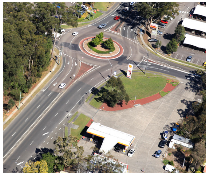
Avoca Drive looking west at intersection of Bungoona and Carrak roads