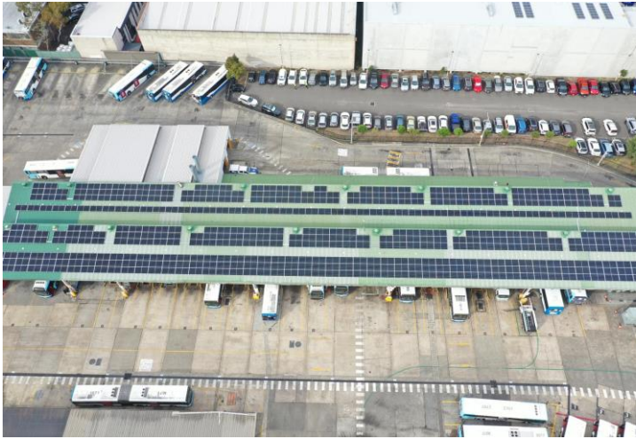
New solar panels installed at Brookvale Bus Depot

We thank you for your ongoing support while we complete this important work.