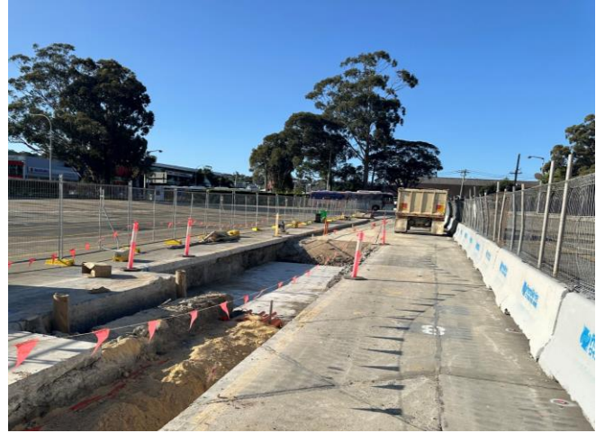
Concrete removal for power supply upgrades at Brookvale Bus Depot