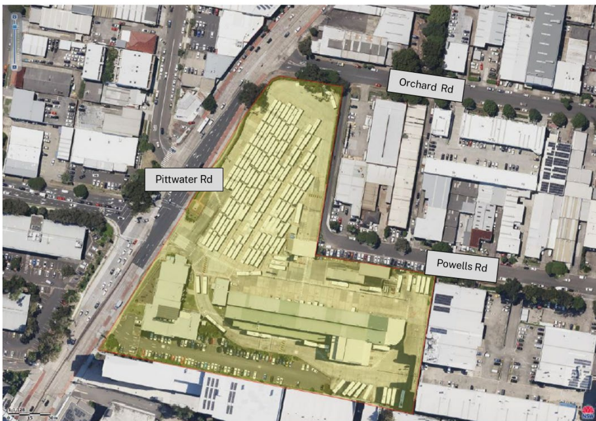
Image: Location of the Brookvale Bus Depot

Transport for NSW acknowledges the Garigal/Garegal people of the Guringai nation as the Traditional Custodians of the lands on which we work and pays respect to Elders past and present.