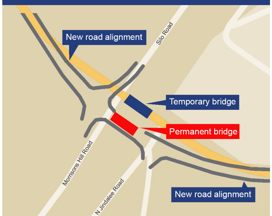
Burley Griffin Way permanent road-over-rail bridge at Wallendbeen

During this period, no trains will be running, enabling the team to carry out work 24 hours a day