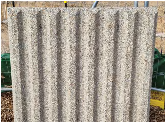
The panel of choice that will be used in the Coxs River Road Upgrade

These panels have been ordered and will be installed on the retaining walls in the coming months.