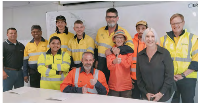
Participants of the pre-employment program at their graduation joined by Transport and Ertech team members

The Program ran through November and all five participants graduated and are now working on the Coxs River Road Upgrade.