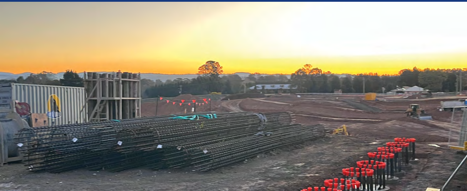
Coxs River Road construction site behind the Lolly Bug, Little Hartley at sunset.

The NSW Government is investing $232 million towards the Coxs River Road Upgrade. This will reduce congestion and improve safety and accessibility for all local and highway road users, commuters and pedestrians.