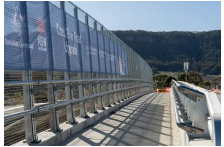
The Coxs River Road Bridge at Little Hartley.