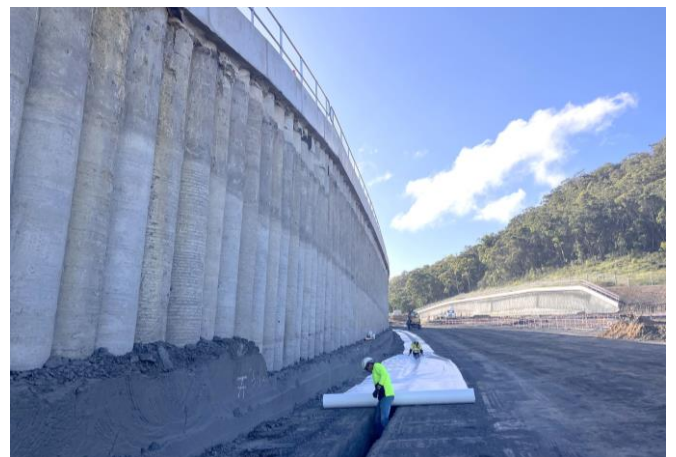
Construction of the retaining wall behind the Lolly Bug in April.