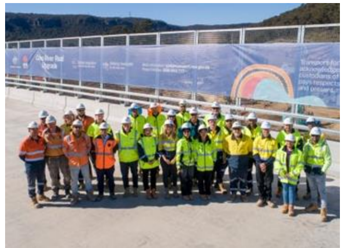
Members of the Transport for NSW and Ertech project teams on the Coxs River Road Bridge during the Federal Government's funding announcement.

We appreciate being given these opportunities to work alongside our local community.