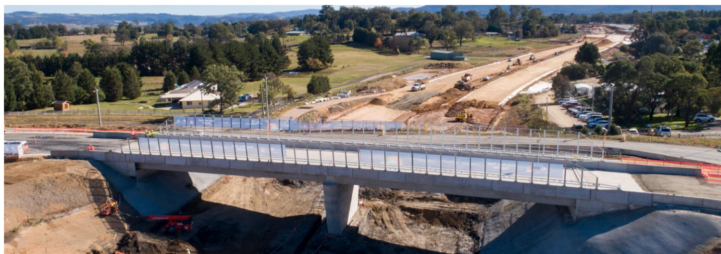
Aerial shot of the new bridge at Coxs River Road which opened to traffic in May 2024.

Together the Australian and NSW Governments are investing $232 million towards the Coxs River Road Upgrade which will reduce congestion and improve safety and accessibility for all road users, commuters, and pedestrians.