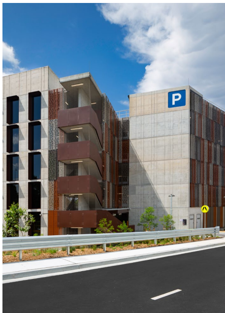
View of the new car park from Soldiers Parade.

The new Edmondson Park North Commuter Car Park with over 900 parking spaces is now open for transport customers.