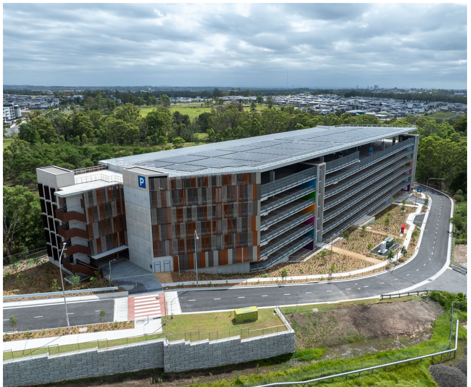
The new Edmondson Park North Commuter Car Park, located off Soldiers Parade.

Customers now have access to around 2000 additional commuter car parking spaces at Edmondson Park, including spaces available in the Edmondson Park South Commuter Car Park.