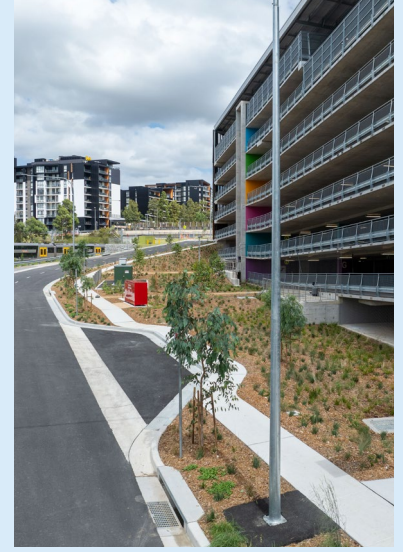
View of the new car park looking towards Soldiers Parade.

The commuter car park projects at Edmondson Park were delivered as part of the Commuter Car Park Program.