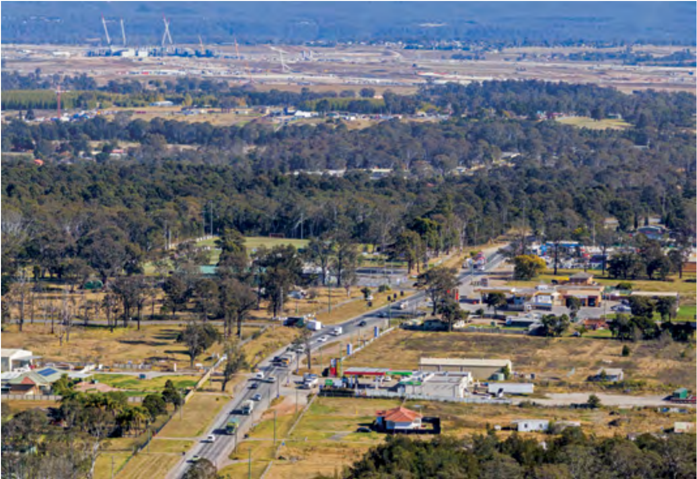
Elizabeth Drive looking west (Ampol Service Station on the right, Kemps Creek United Soccer Club on the left)