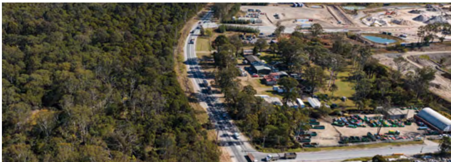
Section of Elizabeth Drive at Clifton Avenue intersection, looking west

Transport for NSW is progressing the upgrade of Elizabeth Drive to improve safety and support growth and connectivity within the Western Sydney Airport precincts.