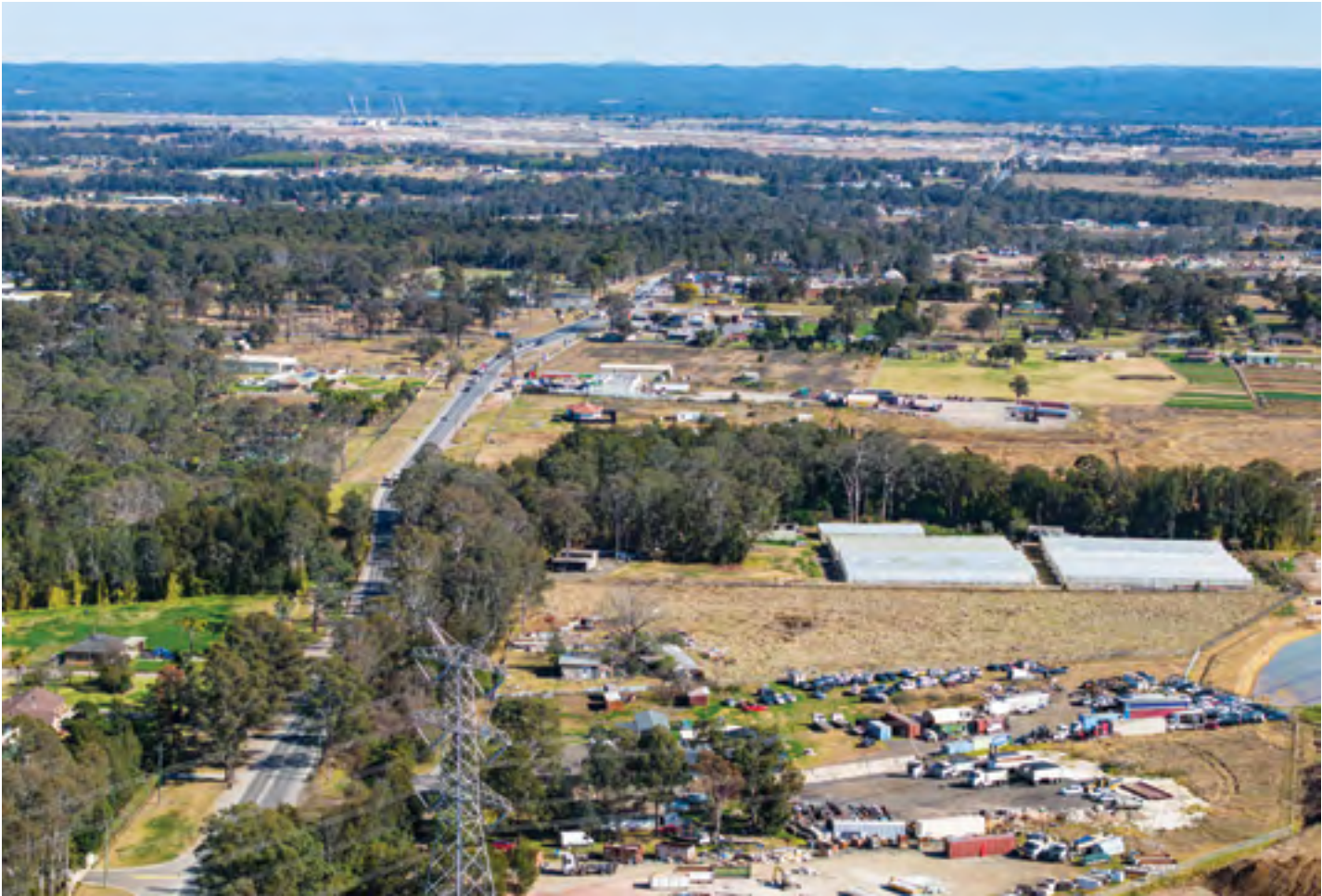
Elizabeth Drive looking west towards Western Sydney Airport