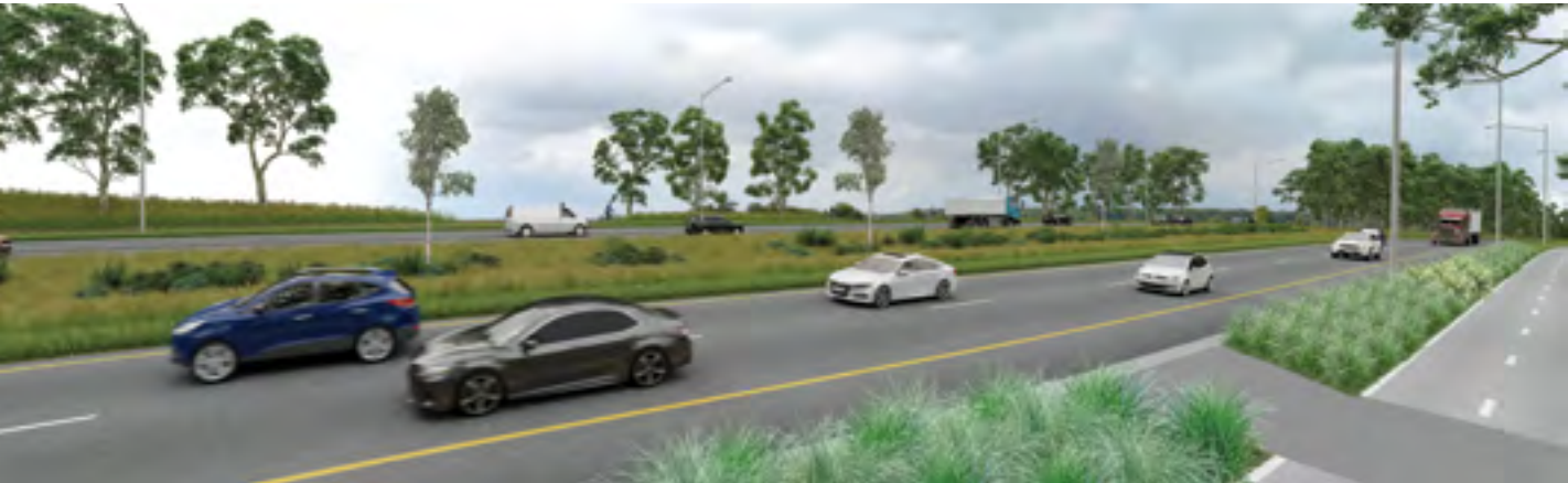
Artist’s impression of the proposed Elizabeth Drive upgrade

Work on these safety improvements is expected to start in late 2024. We will keep the community informed about upcoming activities and any potential impacts and changes.