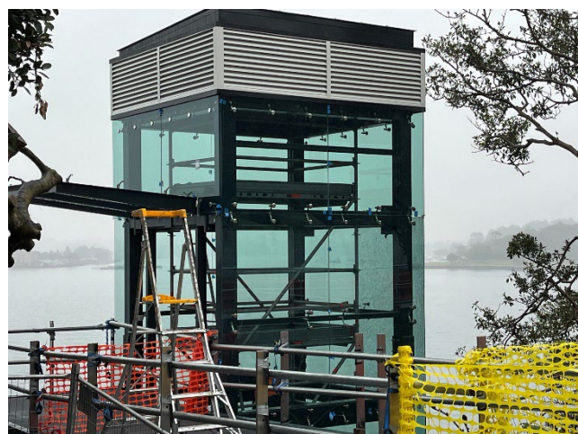
View of the new glass for the lift being installed