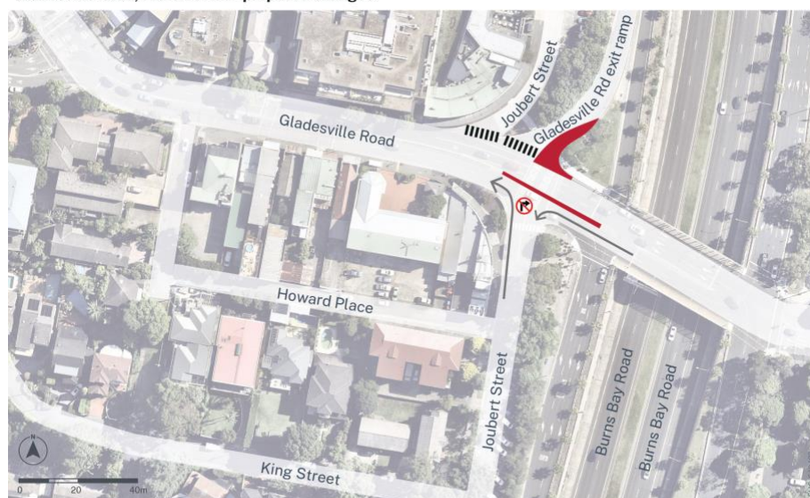
Gladesville Road, Hunters Hill – proposed changes

KEY → Traffic flow No right turn Extended median strip New pedestrian crossings