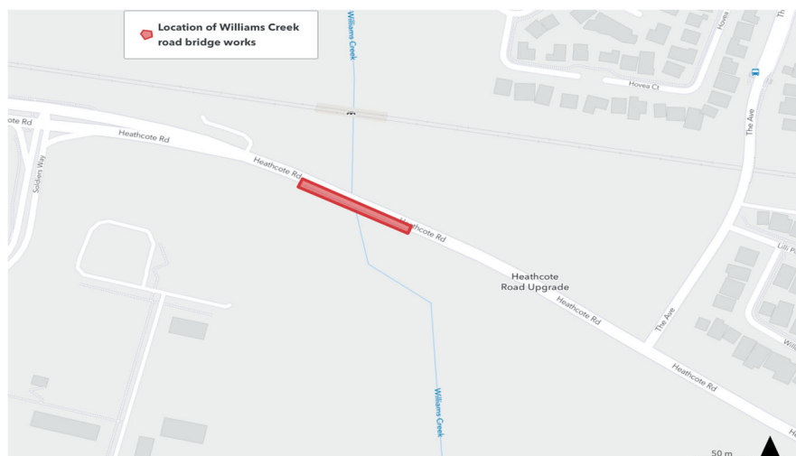
Location of Williams Creek road bridge work