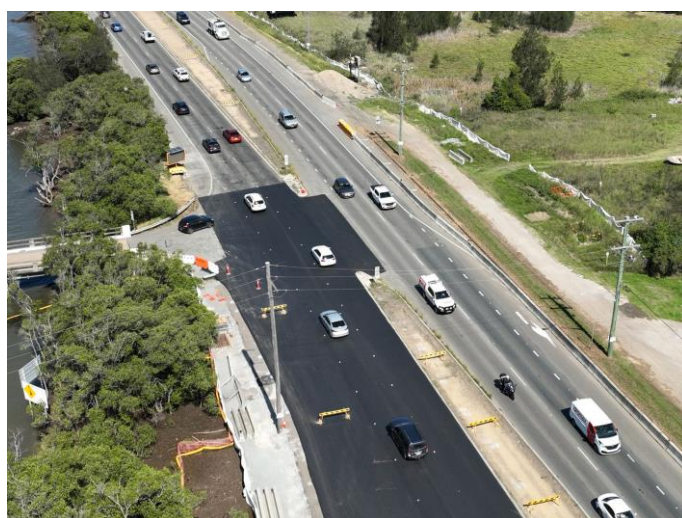
Road widening near Ash Island