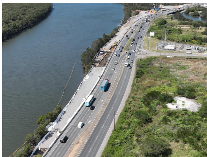
Road widening near Ironbark Creek