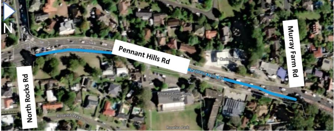
Key —— Project location