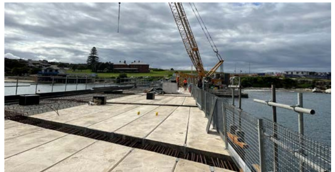
Image below shows the La Perouse Wharf deck planks and temporary fencing for worker safety.

The wharf pre-cast concrete support beams (called headstocks), and planks for the base of the wharf deck / walkway, continue to be installed at both sites. So far, 34 wharf deck planks have been installed at Kurnell and 70 planks at La Perouse.