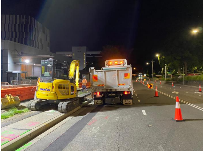
Footpath preparation works along Waterloo Road