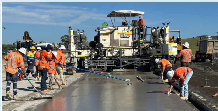
Workers trowelling the concrete pavement