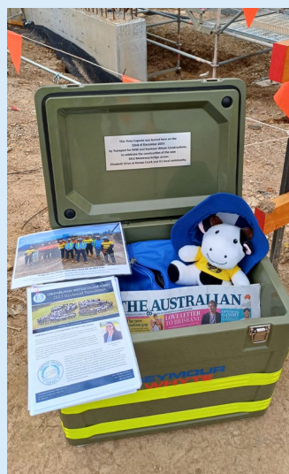
Items filled in the time capsule

To further support the project's sustainability targets, we have started operating a second on-site concrete batch plant. The new concrete batch plant will not only service the project's concreting needs but also reduce truck movements in the area. By taking trucks off the road, we will save large amounts of fuel being used and minimise the project's impact to local traffic.