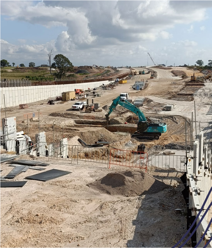
Building Airport Access Road looking north