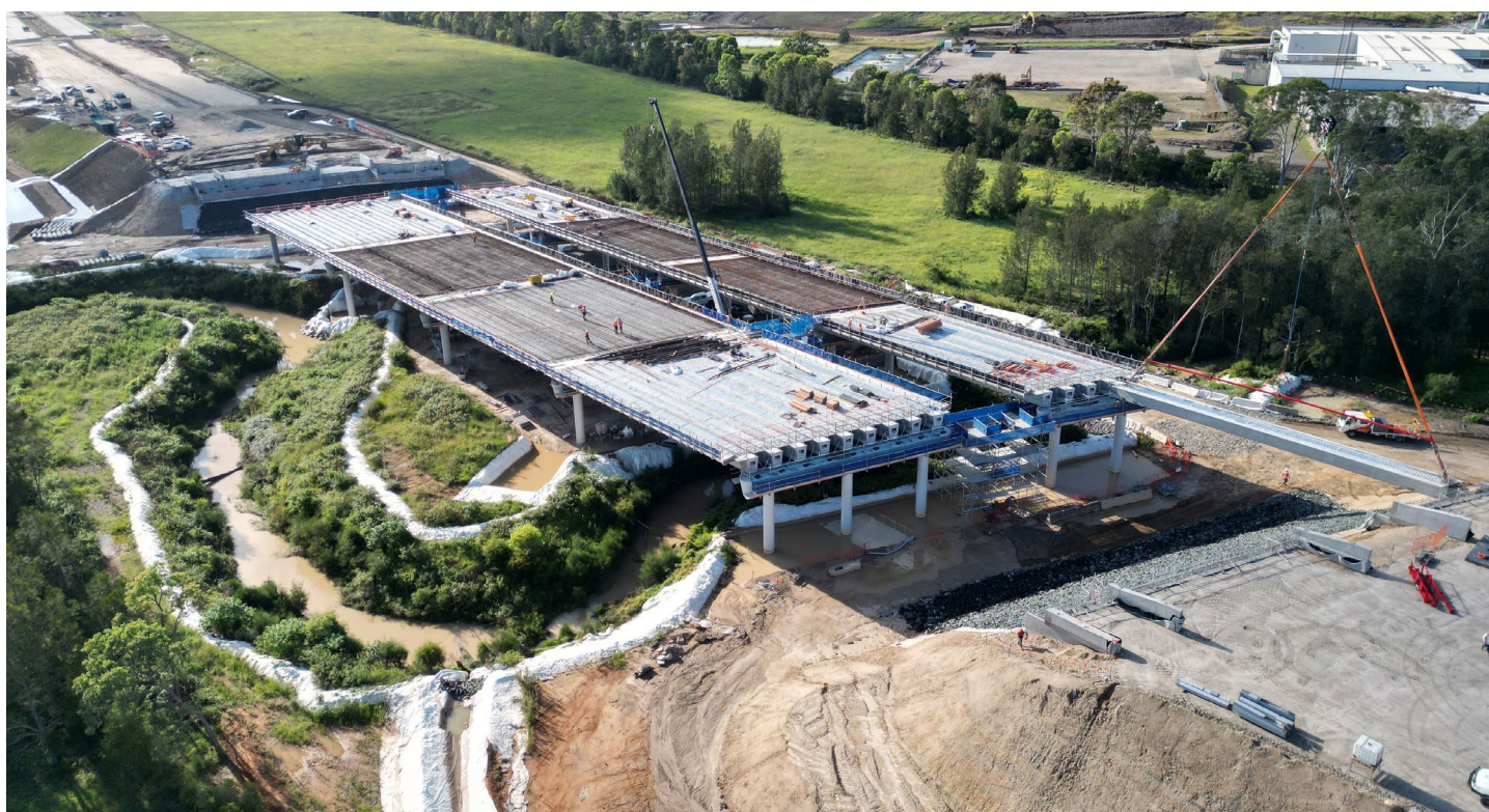
Lifting girders on Badgerys Creek bridge

The Australian and NSW governments are securing a brighter future for Western Sydney's residents, visitors and workers by delivering the new M12 Motorway.