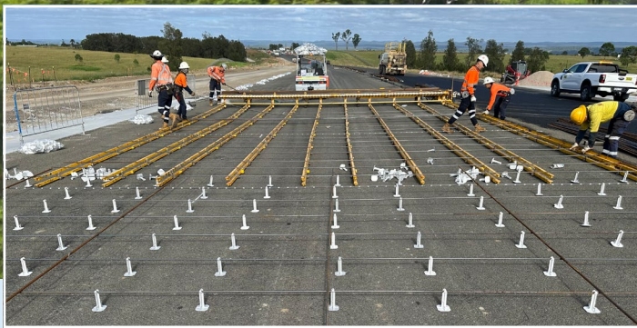
Installing steel reinforcement