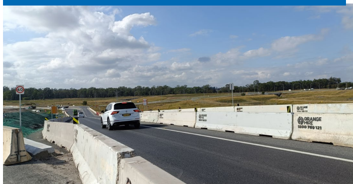
Motorists driving on the new Elizabeth Drive bridge looking east to Badgerys Creek Road roundabout

We'd like to thank the community for their patience and support while we carried out this important work.