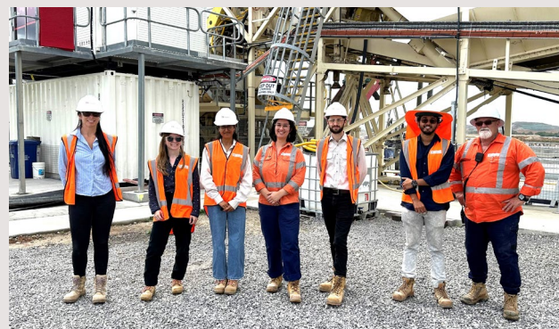
M12 environment team at the project's second concrete batch plant

This initiative was a fun and engaging experience for all involved and provides shared memories for the future.