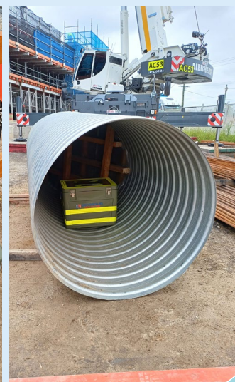
Time capsule ready to be installed