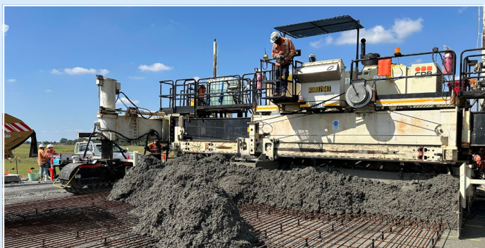
Pouring the final layer of concrete