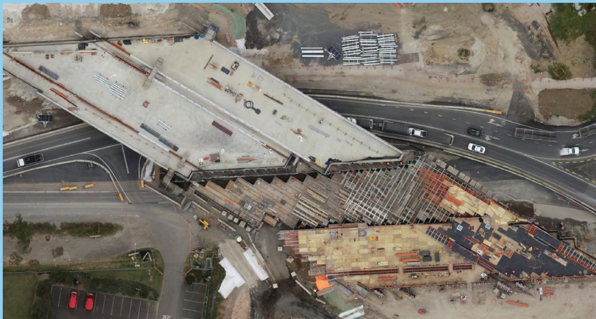
Aerial view of the Elizabeth Drive bridge in Kemps Creek under construction