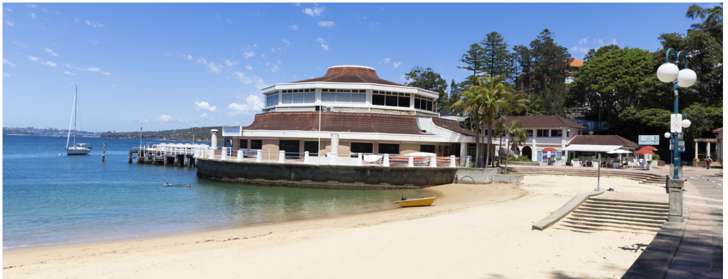
View of the former Sea Life building.

From early July 2024 Transport for NSW will start removing the former Sea Life building to promenade level retaining the circular footprint for future public use. The project will provide more space back to the community and be the first step in meeting our commitment to revitalise this iconic site.