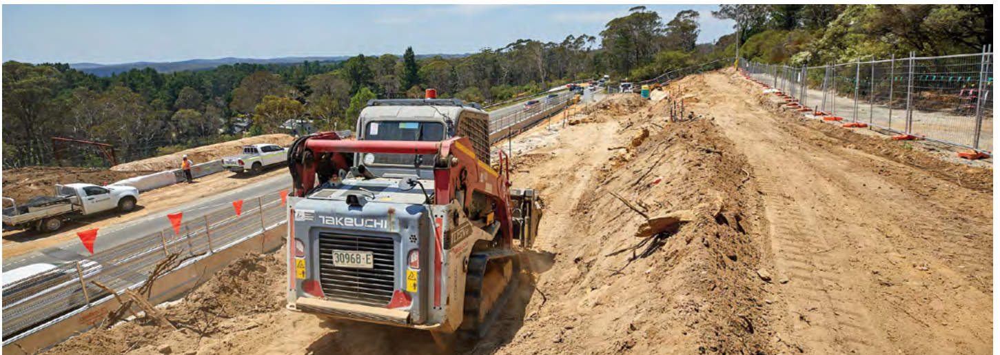
Work in progress alongside the Great Western Highway at Medlow Bath

Please be aware that the speed hump near the PotBelly Cafe is not a pedestrian crossing – and crossing or not, always make sure a driver has seen you before stepping out onto the road.