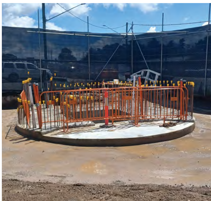
Pouring the new westbound elevator shaft

Transport for NSW is committed to making it safer for everyone to use our roads and train network, and we use every opportunity in our projects to improve safety.