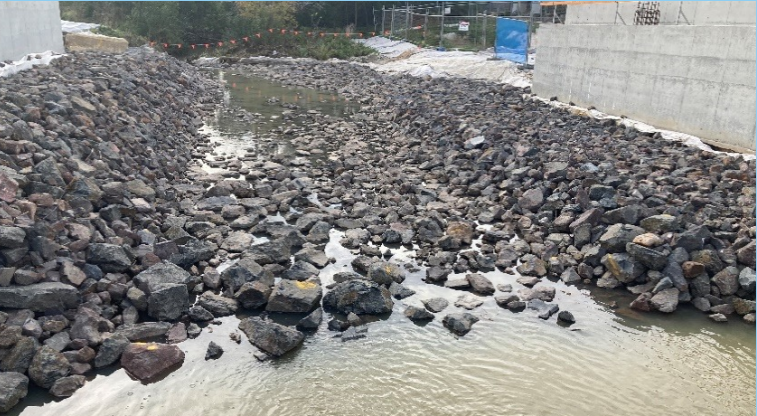
Strangers Creek before, without low-flow channel (facing North)