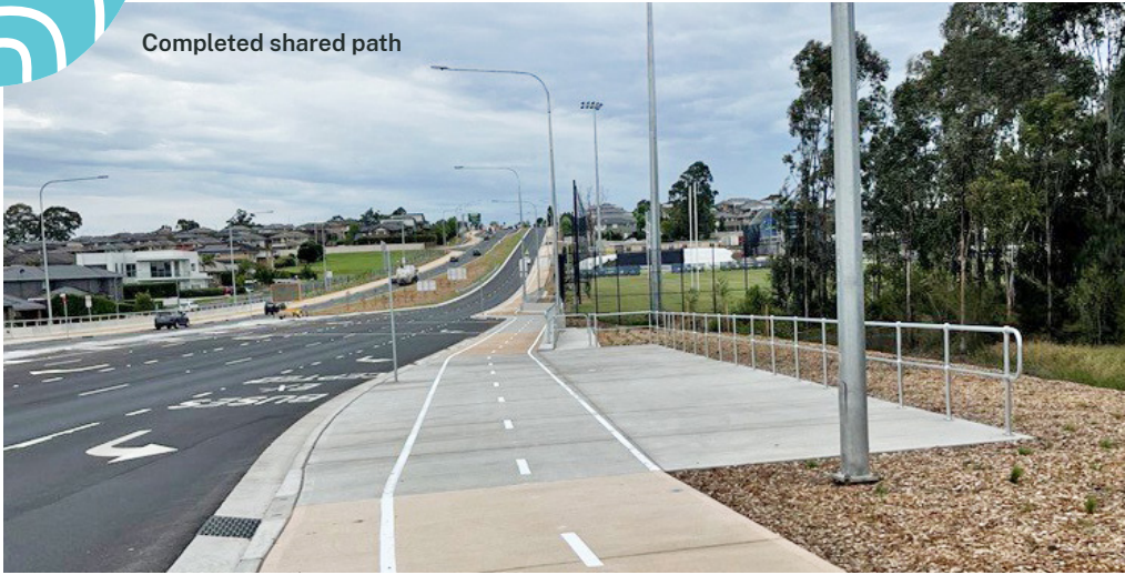
Completed shared path

A pedestrian and cycling path along both sides of Memorial Avenue provides a new active transport link. The upgrade will also improve public transport with an increased number of bus stops with bus shelters, which will be complete early 2025.