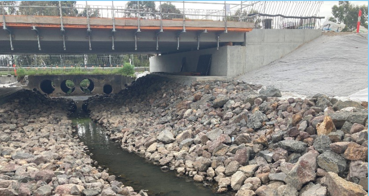
Strangers Creek after, with low-flow channel (facing South)