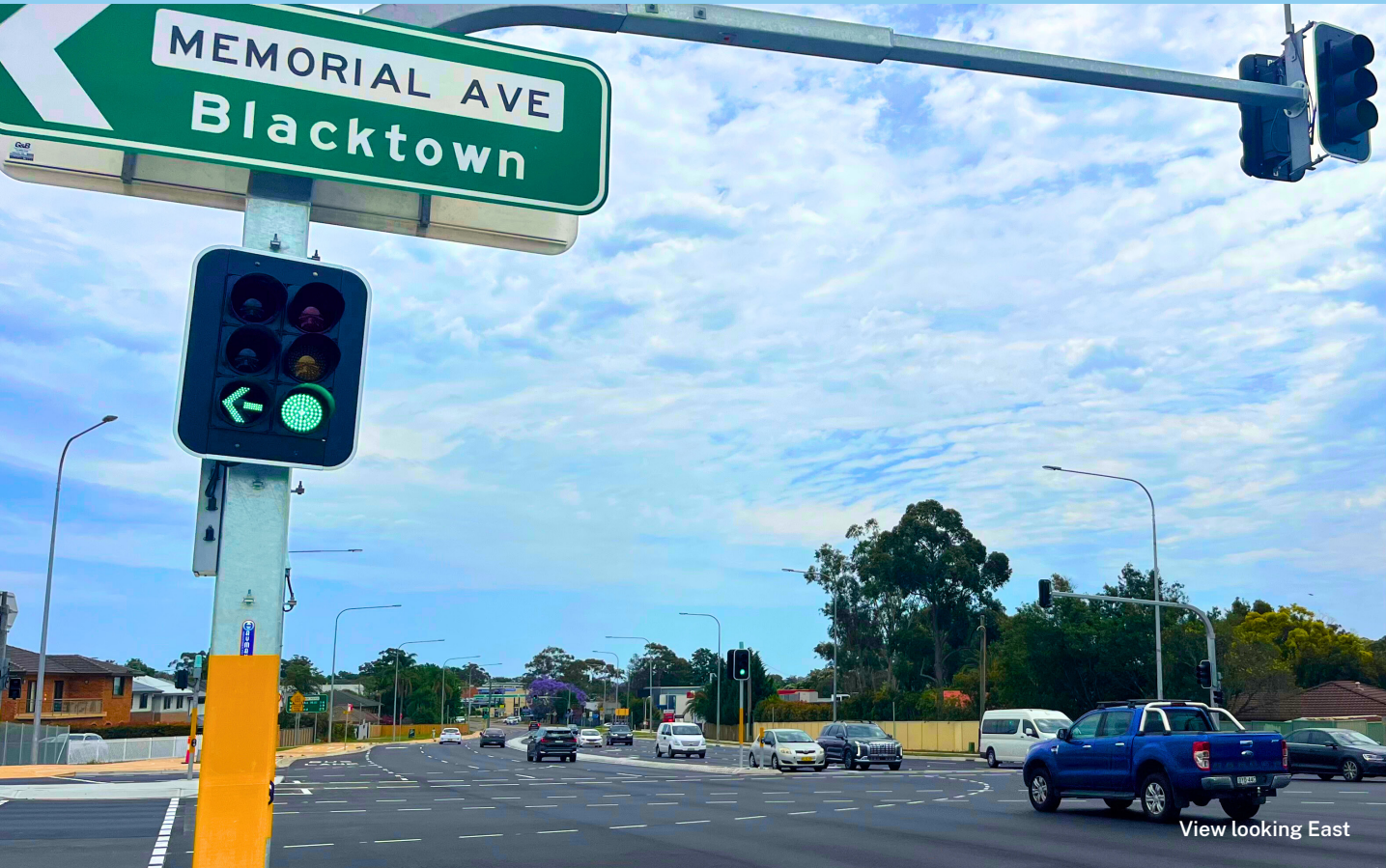
View looking East