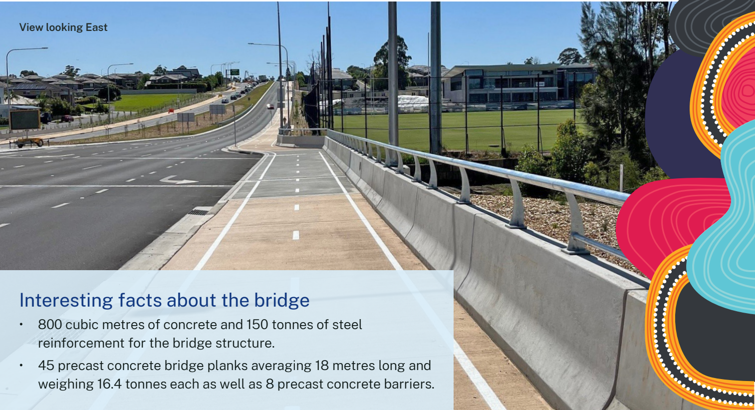
View looking East

We would like to thank the community for their support during the upgrade works, particularly with our night works.