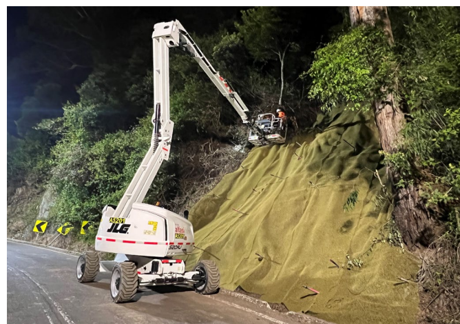
Repairs on a landslip site on Cambewarra Mountain were completed in May 2023.