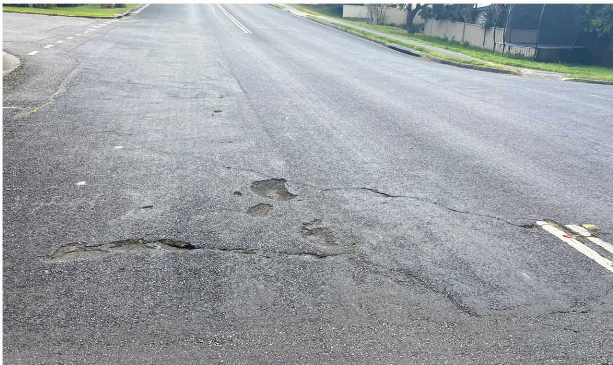
Photo 1: Southern end of north bound lane of Dent St at Hill St, facing north

Included below are photographs of the existing conditions of Dent Street as recorded on 05/07/2024.