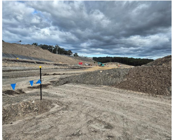
Image 6: View of JHH boundary in the distance and from mainline looking southwest.