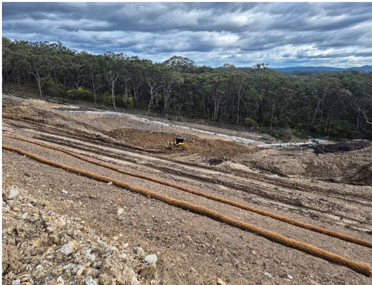
Image 7: View looking west from the mainline at the rehabilitation of the Fill 2 / Creek 3 sediment basin.