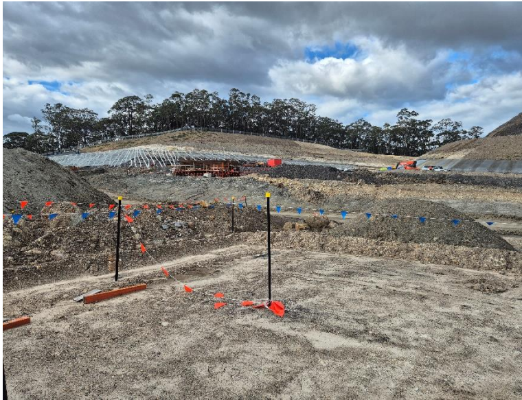
Image 5: View of the JHH traffic interchange from the mainline looking northeast towards the entry/exit.