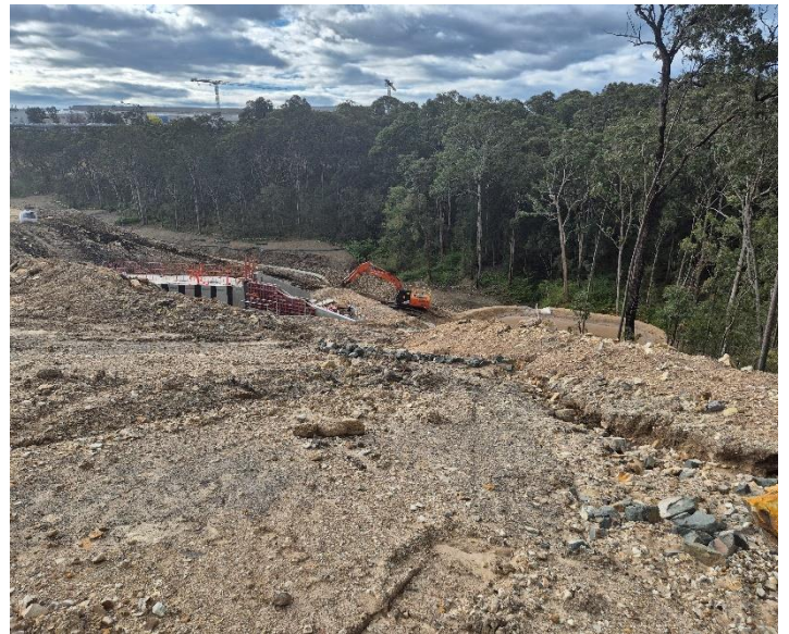
Image 8: View of the southern end of the mainline works looking north across to the eastern boundary. Excavators have been cleaning out sediment basins however constant rain has made access challenging.