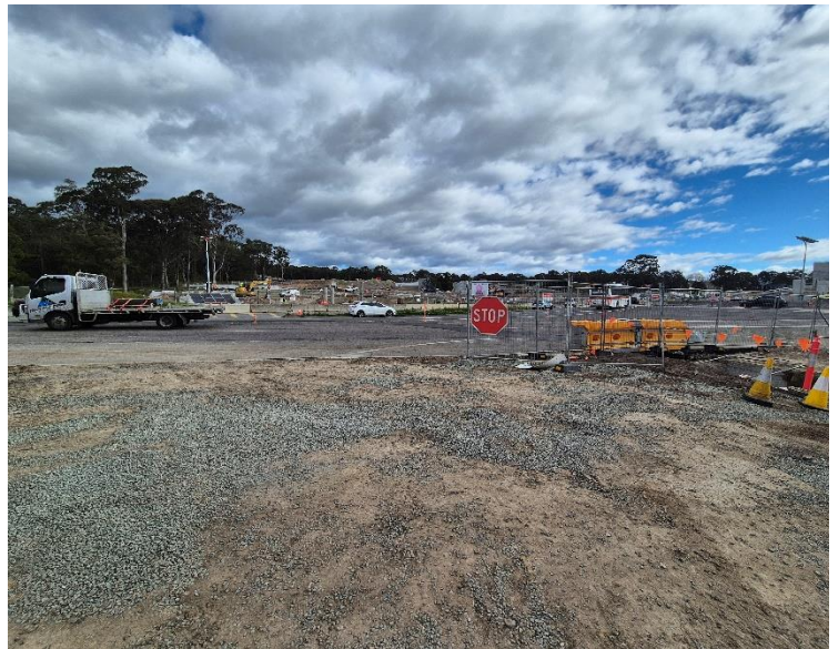
Image 2: Northern Interchange, photo is taken from the northeast corner (Robert Street) looking south across to the Newcastle Road and down the mainline.