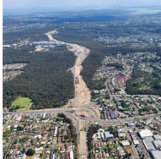
Photo: Aerial photo looking south

This Environmental Representative (ER) Monthly Report is prepared in accordance with the Minister's Condition of Approval A26(k) for the Newcastle Inner City Bypass: Rankin Park to Jesmond (SSI-6888) and is consistent with the Environmental Representative Protocol (October 2018).