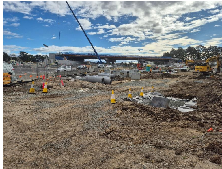
Image 1: Northern Interchange, photo is taken from the northeast corner (Robert Street) looking west across to the Newcastle Road roundabout and the new bridge girders.