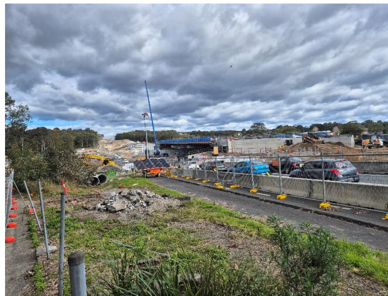
Image 3: Northern Interchange, photo is taken from the northeast corner (Robert Street) looking south across to Newcastle Road and the mainline.