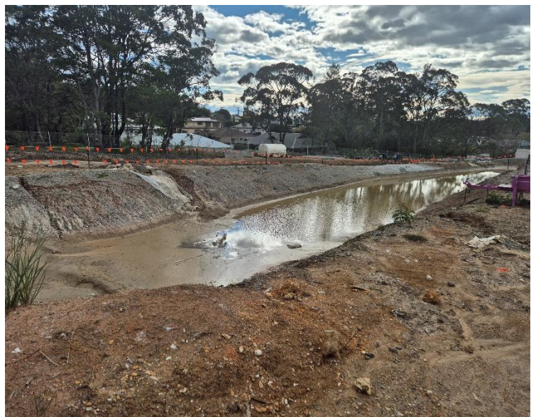
Image 4: Hollywood sediment basin at the northern end of the main showing damage that has occurred to the inlets. Work was being undertaken throughout the site to repair basins following rainfall events.