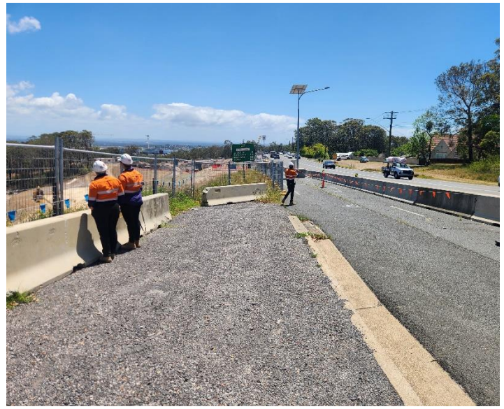
Image 8: Southern Interchange, Lookout Road traffic realignment, looking north.