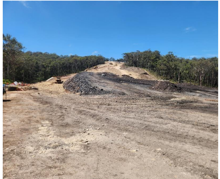
Image 6: Main line looking south towards McCaffery Drive. The dark material is extracted sedimentary deposit.