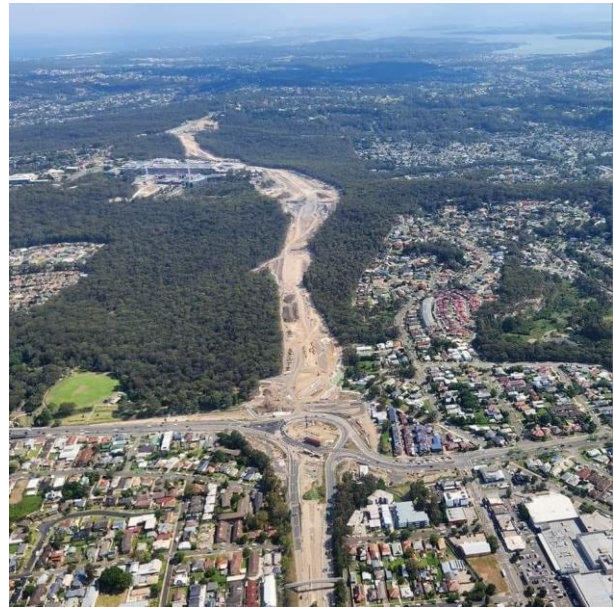
Photo: Aerial photo looking south

This Environmental Representative (ER) Monthly Report is prepared in accordance with the Minister's Condition of Approval A26(k) for the Newcastle Inner City Bypass: Rankin Park to Jesmond (SSI-6888) and is consistent with the Environmental Representative Protocol (October 2018).