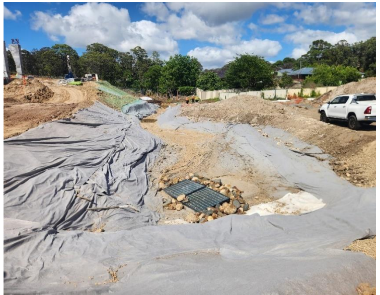
Image 4: Northern Interchange, clean water ErSed controls. The fences are the rear boundary of the houses on Victory Parade.