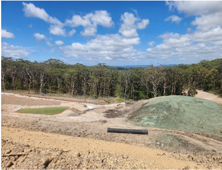
Image 5: Midway through main line, view looking west. ErSed controls in this area have been reinstated following the November 100mm+ rain event.