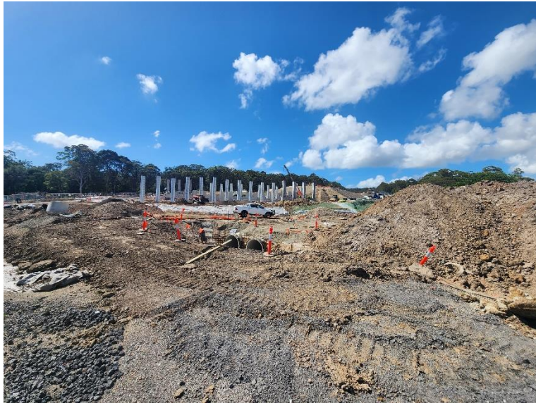
Image 1: Northern Interchange, view looking south from site compound. Structures are bridge footings.