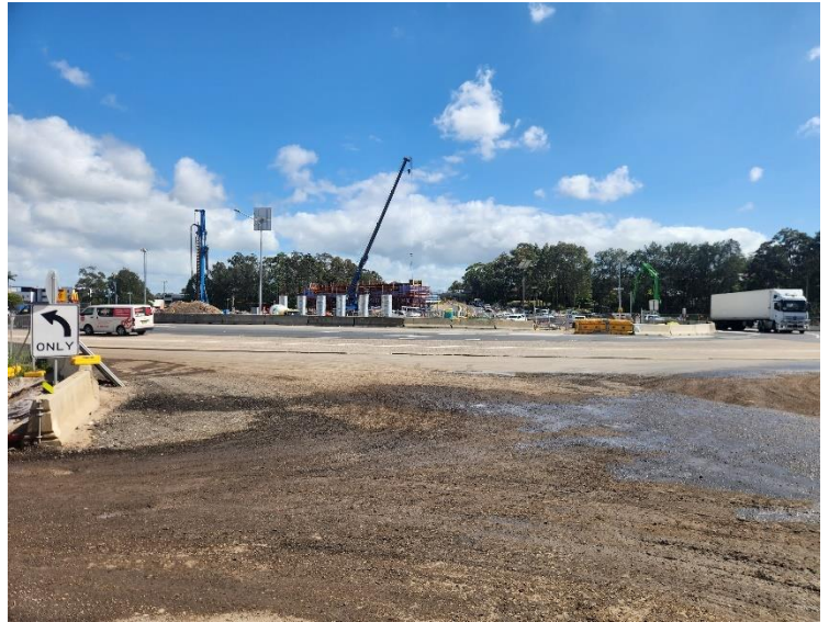
Image 2: Northern Interchange, view looking north over the Newcastle Road roundabout. Structures are bridge footings.