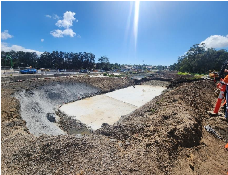
Image 3: Northern Interchange, Dark Creek culvert realignment works. Southern side of Newcastle Road.