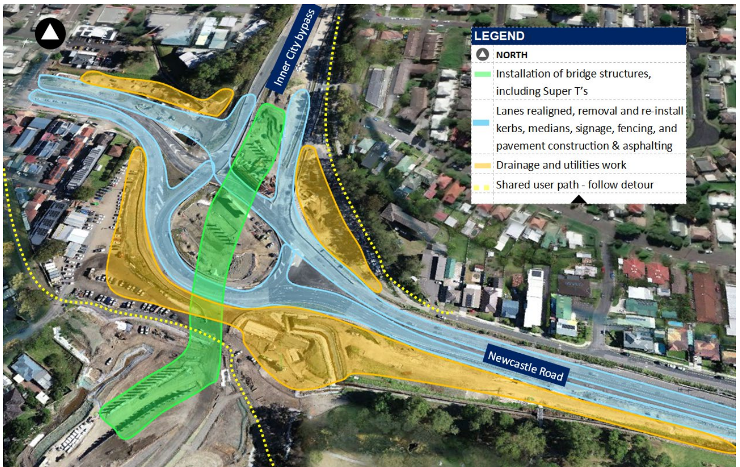
This is an artist impression only and is not to scale.