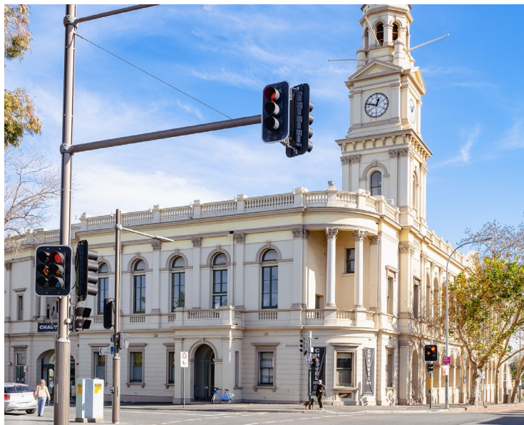
Paddington town hall, Transport for NSW

Events and activations to help enliven Oxford Street and attract visitors to the area. These events could highlight Oxford Street's strengths (art, design, fashion, and food) or link with established festivals such as Vivid or Mardi Gras.