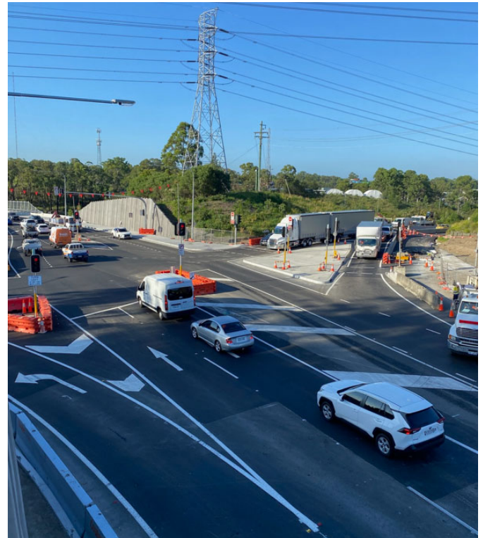
New traffic signals at the M4 Motorway eastbound intersection