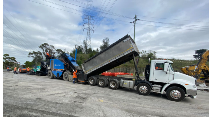
Pavement works on Prospect Highway at the newly upgraded M4 Motorway eastbound intersection.

The community will be notified in advance of these changes and will be provided information on the detours.