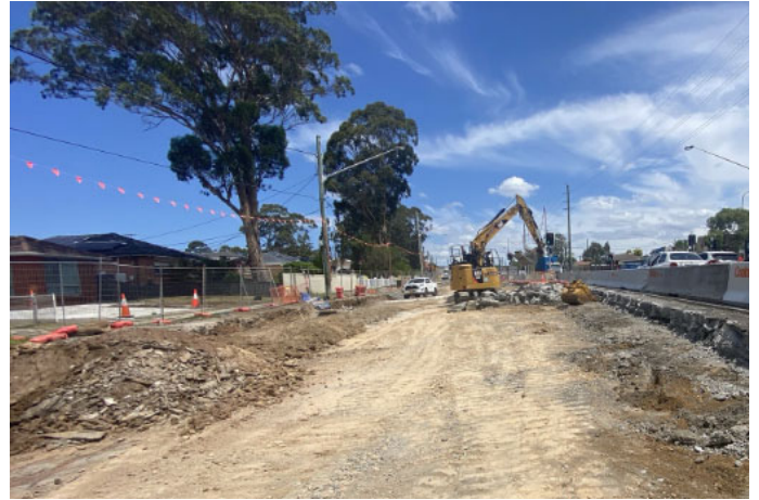
Earthworks at Prospect Highway and St Martins Crescent intersection

For the latest traffic updates, call 132 701 , visit livetraffic.com or download the Live Traffic NSW App.