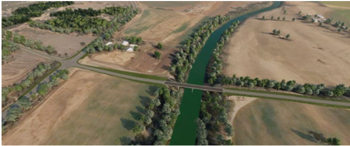
Artist's impression of the new bridge at Rawsonville

The Rawsonville Bridge Replacement project includes the construction of a new concrete bridge around five metres upstream from the existing bridge, construction of new approach roads either side of the bridge, and removal of the old bridge once the new bridge is operational.