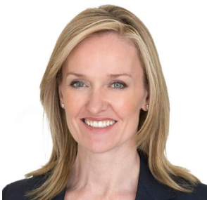
The Hon. Natalie Ward MLC Minister for Metropolitan Roads

We encourage local councils to review the RLRRP Guidelines and work closely with Transport for NSW to apply for the funding needed to repair their road networks to keep communities, families, and businesses connected.