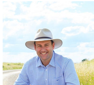
The Hon. Sam Faraway MLC Minister for Regional Transport and Roads