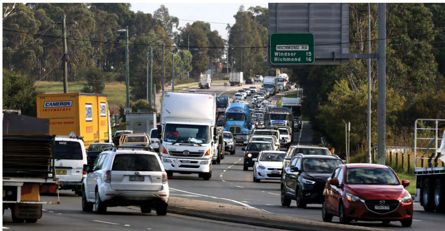
Peak hour traffic queueing along Richmond Road

The Australian and NSW Governments are funding the proposed Richmond Road upgrade between M7 Motorway and Townson Road, Marsden Park as part of North West Growth Centre Road Network Strategy to support development in the fast-growing North West Growth Area.