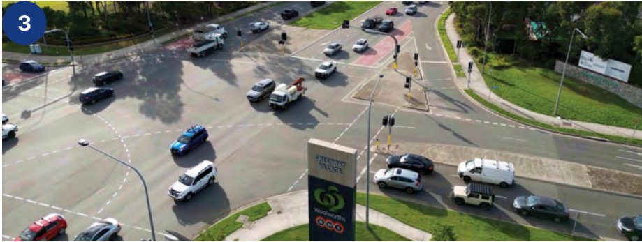
Pictured left to right: 1) Artists impression of new flyover bridge and shared path, 2) peak hour at Richmond Road and Rooty Hill Road North Intersection, 3) aerial photograph of Richmond Road, Langford Drive and Alderton Drive Intersection