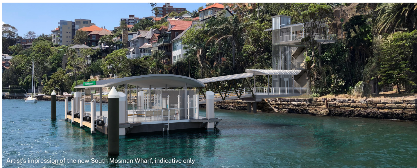
Artist's impression of the new South Mosman Wharf, indicative only

South Mosman Wharf is being upgraded as part of the Safe Accessible Transport program to make public transport safe, inclusive and easy to use for all passengers, especially people with disability, older people, people with prams or luggage and people with limited mobility.