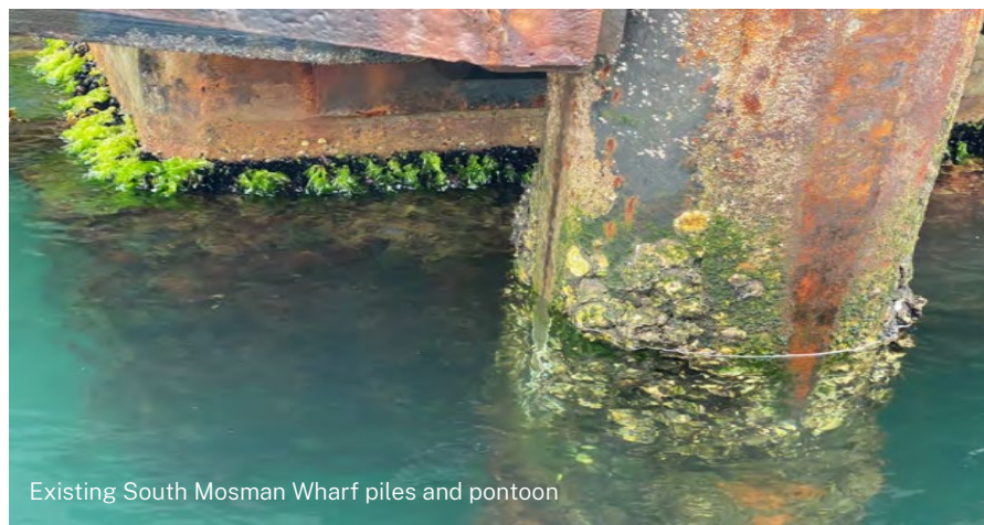
Existing South Mosman Wharf piles and pontoon