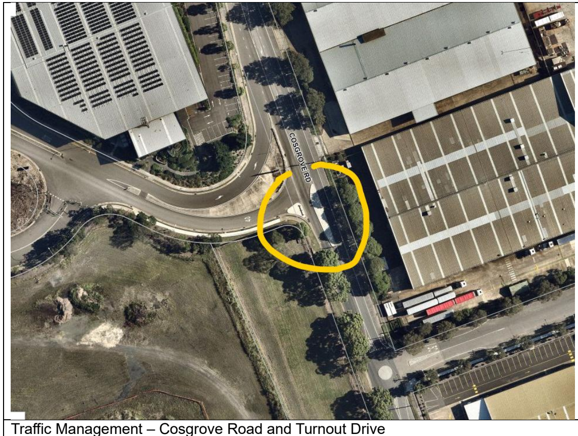
Traffic Management – Cosgrove Road and Turnout Drive

Council also supported Sydney Ports with traffic management islands at the intersection of Cosgrove Road and Turnout Drive. See figure 3.