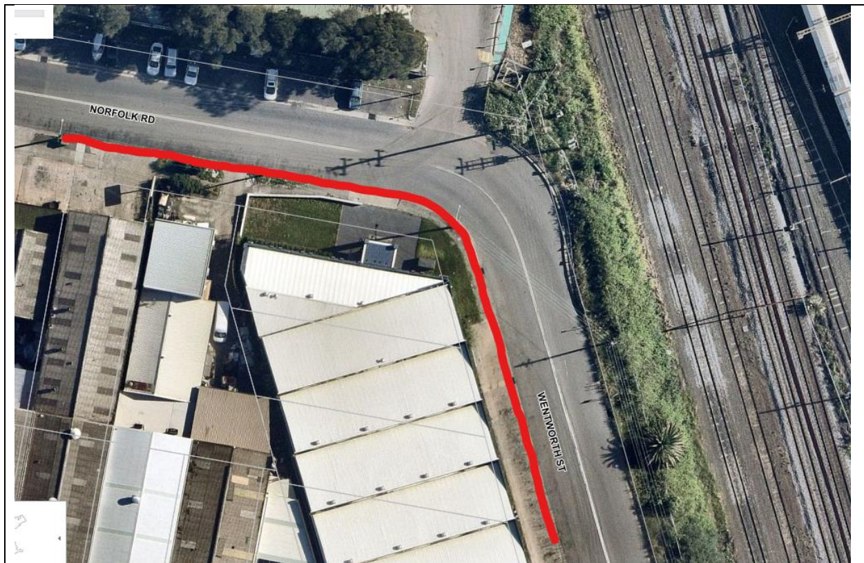
No Stopping shown in Red

In addition Council has a close working relationship with NSW Ports including the Facilities Manager at the Enfield Intermodal Centre, in recent times Council has approved the extension of No Stopping restrictions on the inside of the bend in Norfolk Road/Wentworth Street to improve the swept paths for B Double vehicles See figure 2