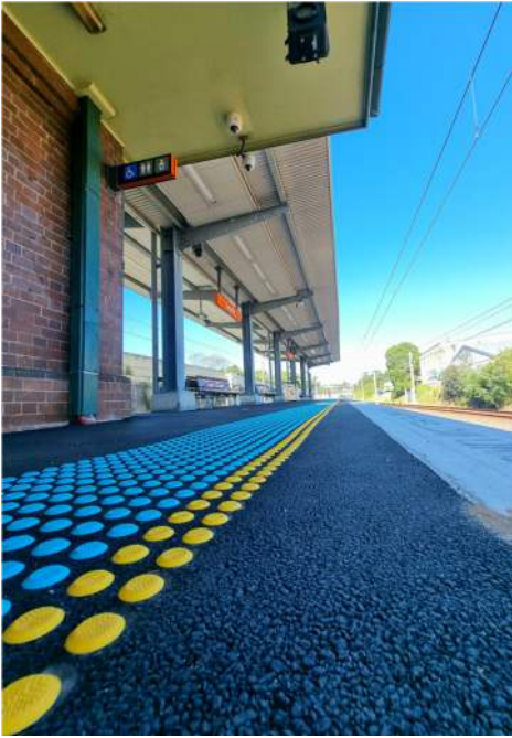
New tactile ground indicators