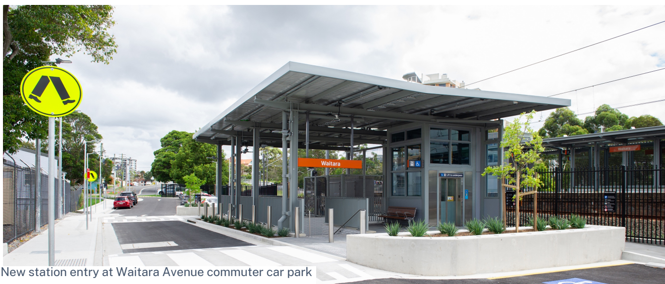
New station entry at Waitara Avenue commuter car park