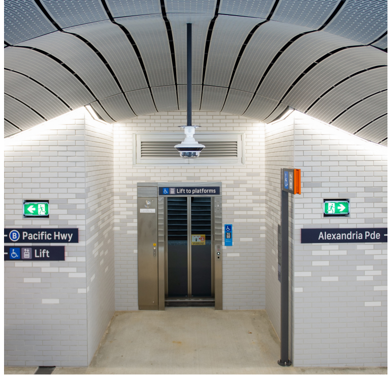
New station underpass with lifts on northern end of platform

We would like to thank the community for their continued support and cooperation. With the help of the community's feedback, support and patience, the Waitara Station Upgrade was completed on time, and now provides the community with an accessible, secure and integrated station.