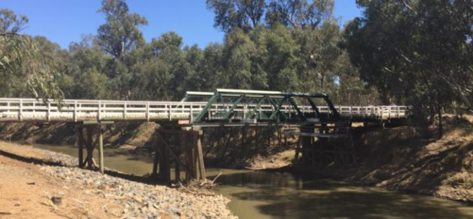
The existing Warroo Bridge on Warroo Bridge Road

The existing Warroo Bridge will remain in service until the new bridge is opened to traffic.