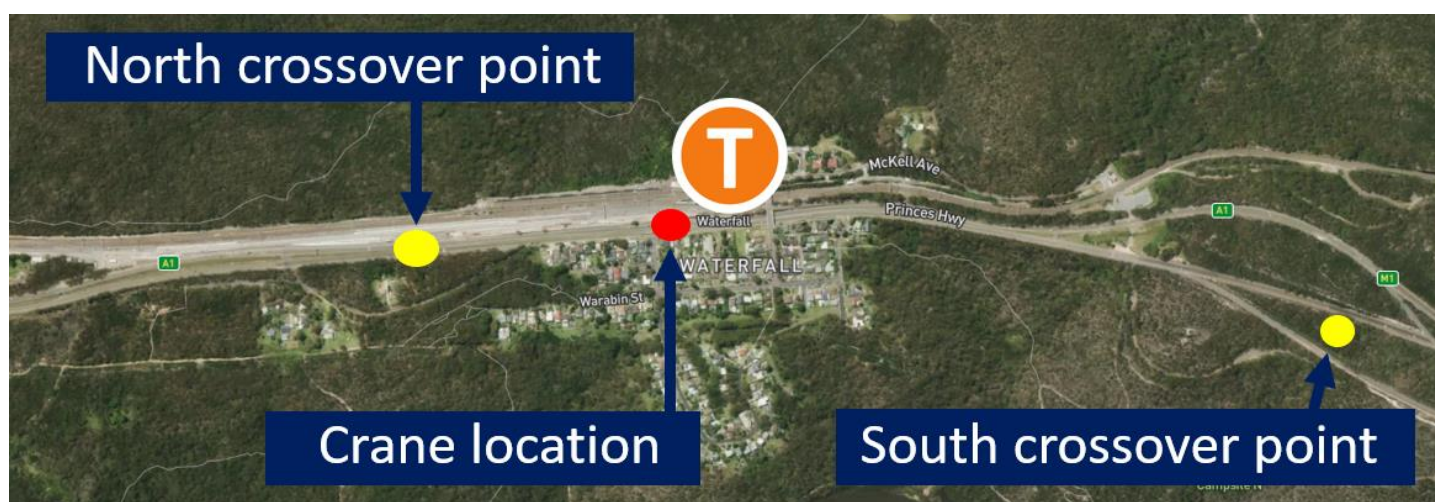
Map identifying the lane crossover locations and 1.6 kilometre stretch of traffic changes