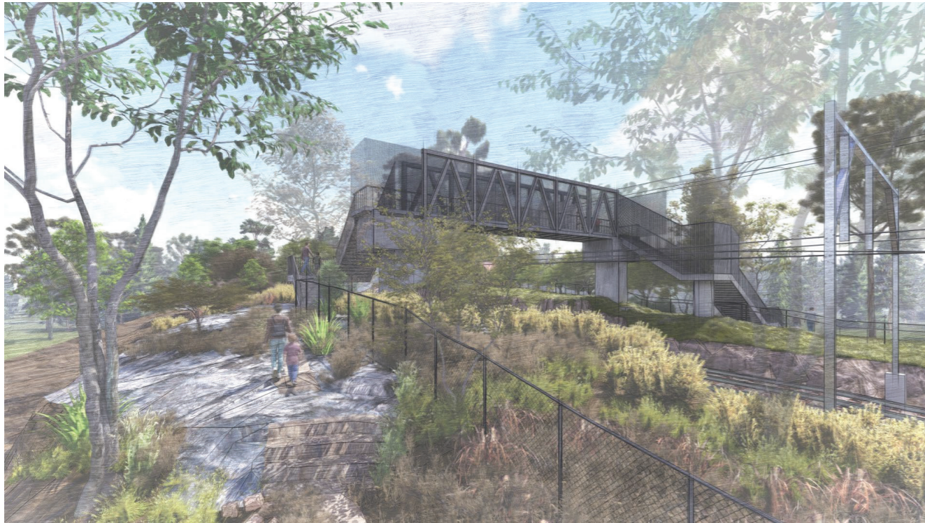
Option A: View from Railway Parade approach