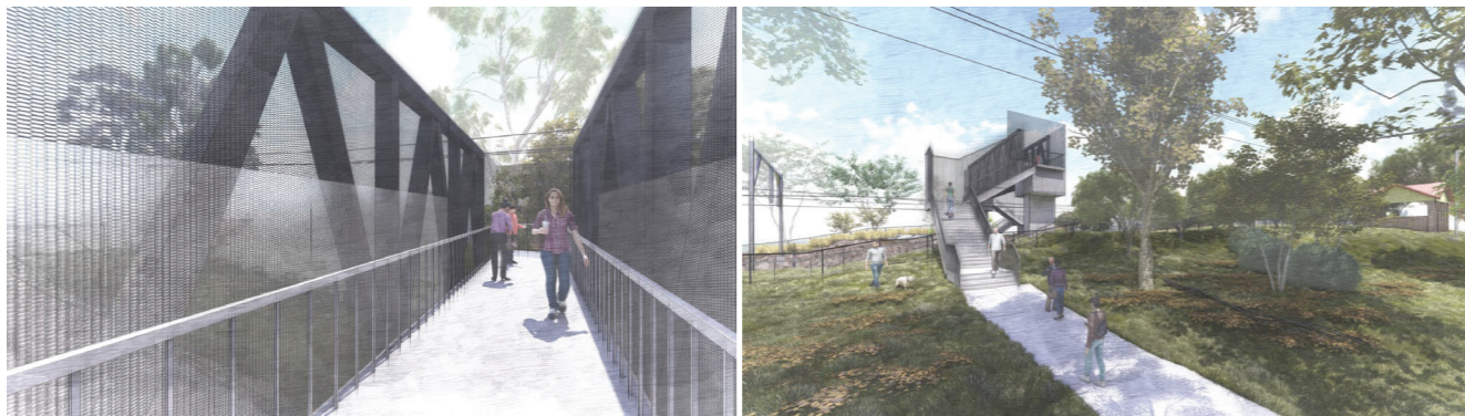
Option A: From bridge deck