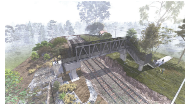
Option A: Open roof

Monday 29 January to Friday 23 February 2024