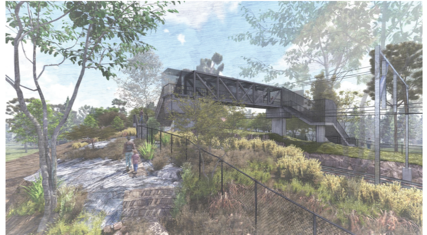
Option B: View from Railway Parade approach