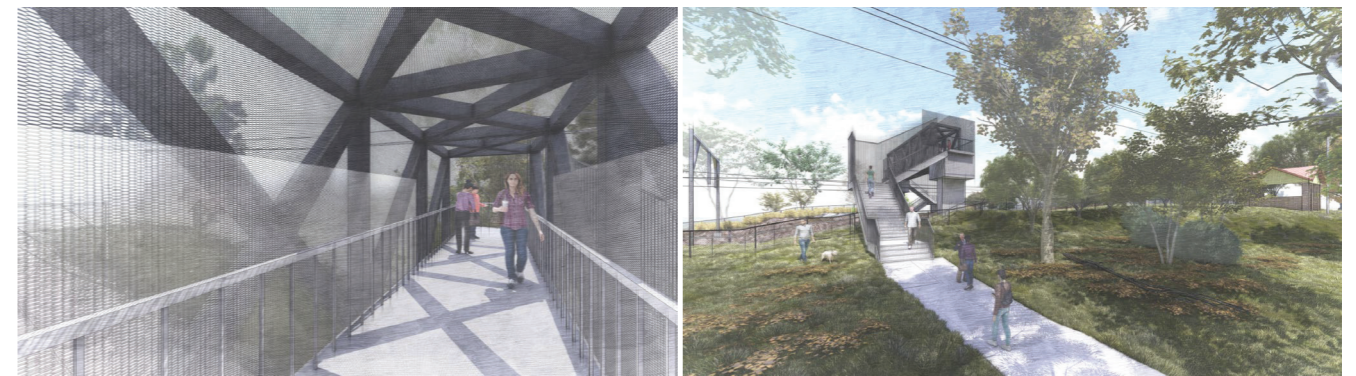
Option B: From bridge deck